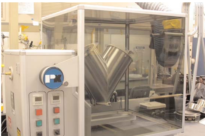
Twin-shell blender for powder granulation and binder addition