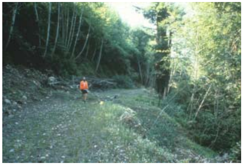
Before and after restoration shots.

Still it will take many more years for this redwood ecosystem to truly recover. Healing takes time and understanding.