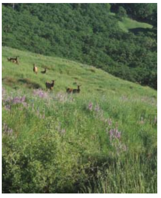
Spring arrives for Roosevelt elk on the slopes of the Bald Hills.

As summer temperatures soar above 90 degrees Fahrenheit, the landscape turns amber. This might make it hard for a human to spy buff-colored coyotes but it doesn't hamper the coyotes' hunting capabilities and neither does the topography. The lumpy terrain has been likened to "amphitheater-shaped relief." Mudslides occur under this surface of clay and