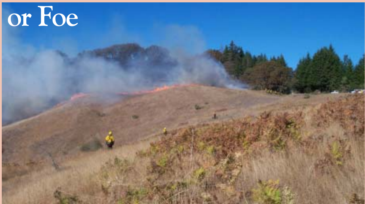
Fall burns are carefully timed to take advantage of cured grass and the onset of the rainy season.

The burning of forests and grasslands defines a complex relationship that humans have had with fire and our environment for eons. Farmers use fire to burn the residue of crops or to clear brush. For American Indians of the redwood region, burning kept the high grassy prairies and oak woodlands free from the encroachment of forests. The