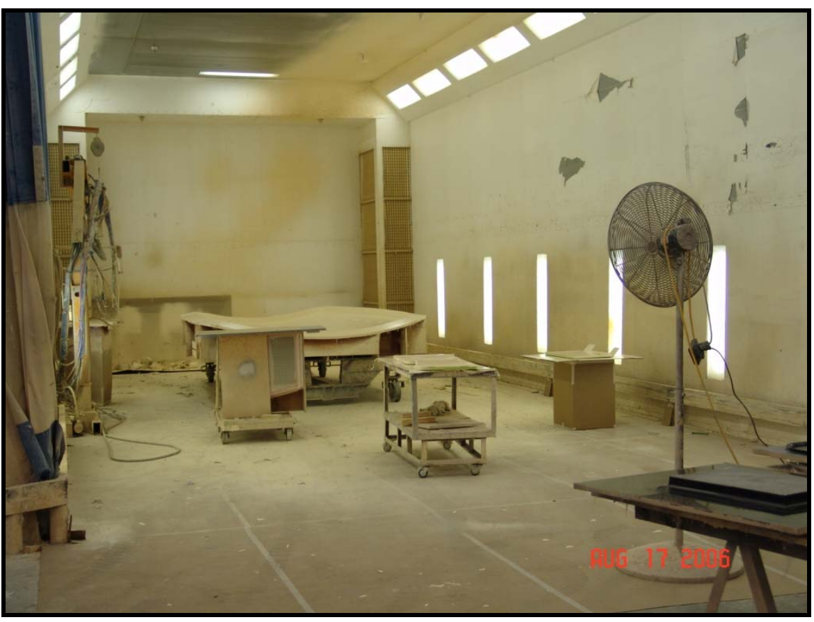
Figure 2: Gelcoat booth containing small part molds during the curing process