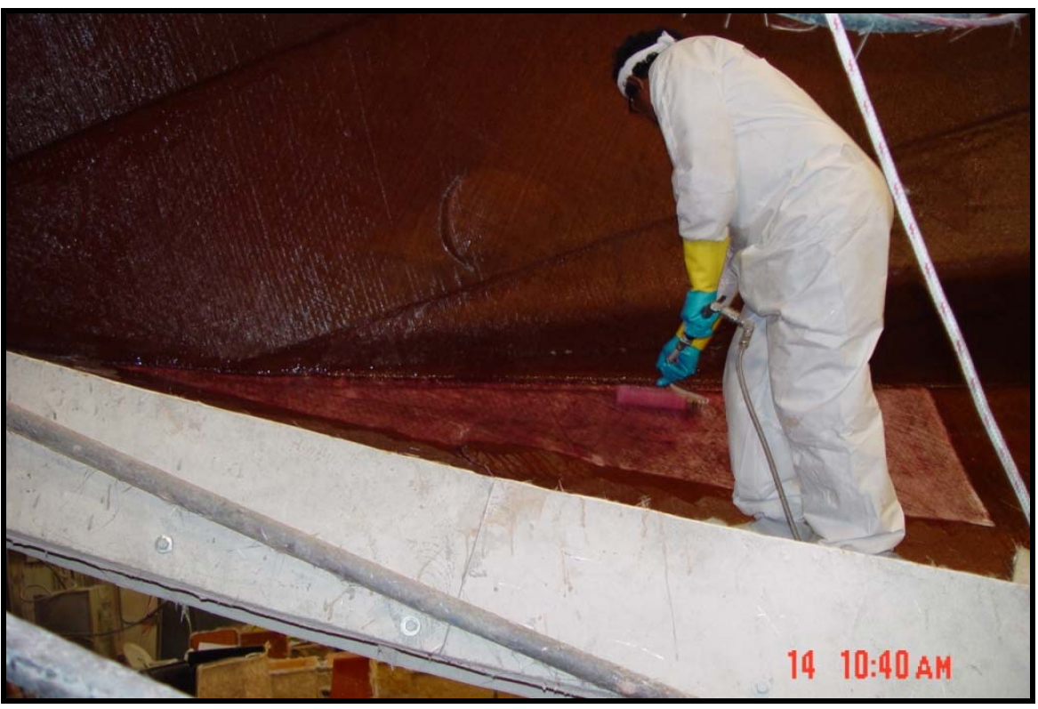
Figure 3: Large part laminator releasing resin using the pressure-fed perforated rollers

Additional layers of fiberglass cloth saturated with resin are added in layers until the part attains its final desired thickness. These layers are compressed by rolling the top surface by hand. During deck lamination, a six inch metal rolling head attached to a wooden handle is used to eliminate any air pockets between the layers of resin-saturated fiberglass. Nearly twice as much resin is used to laminate hulls as is used on decks. A table displaying the resin usage for each section of the boat can be found in Table 2. A unique aspect of sailing yachts is the keel cavity that is deeper in sailboats than most other FRP boats. The keel is manufactured as part of the hull. This keel is problematic during lamination; potentially causing high exposures.