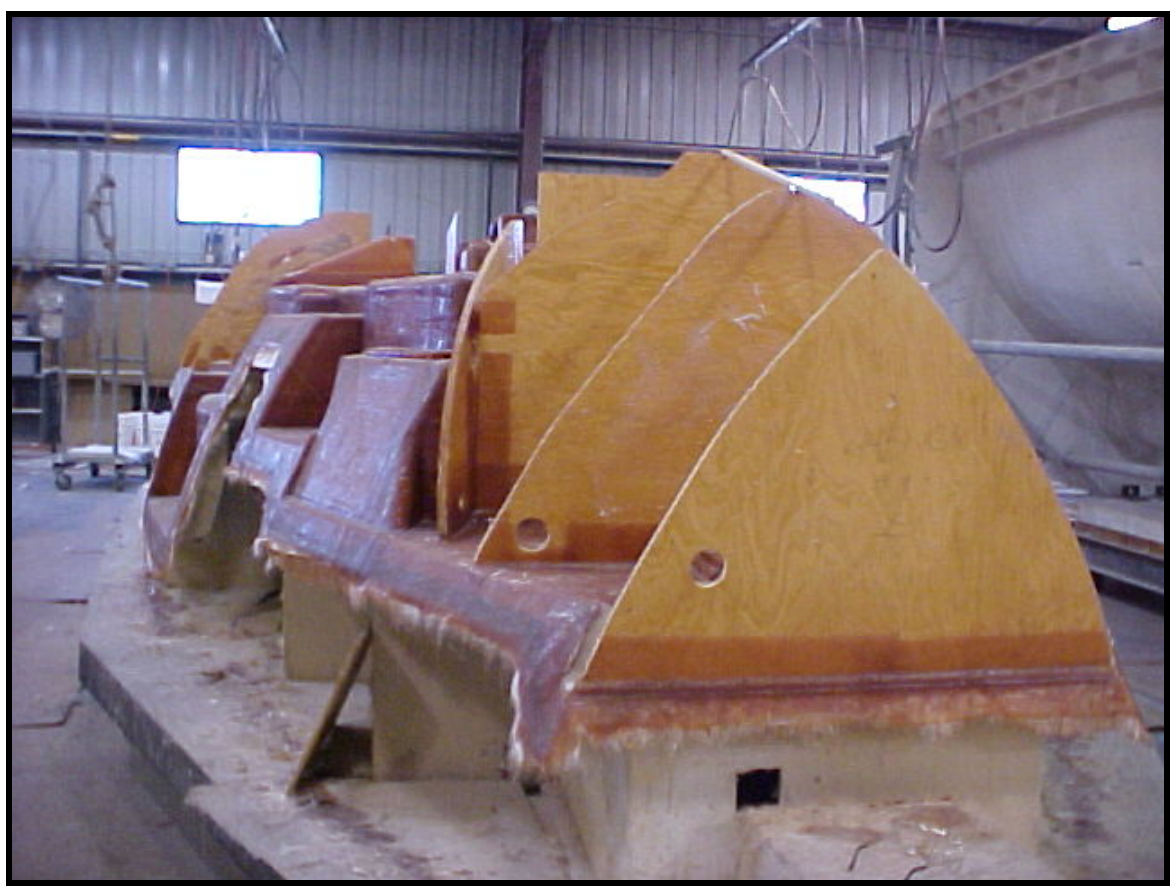
Figure 4: Internal Glass Unit (IGU)

laminators, the air-samples taken for these two jobs were grouped together and classified as large part laminator.