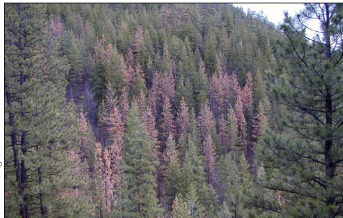
Tree-killing insects such as western pine beetle spread easily through widespread, densely stocked dry forest. The forest continuity is markedly different from the mosaic pattern historically found in dry forest in fire-prone provinces.

The abundance of natural fire refugia was highly variable across the dry provinces. For example, one study in the Wenatchee Mountains found that less than 20 percent of the presettlement landscape was historical fire refugia. Another study found that LSOF patches in the eastern Cascade Range historically ranged from 3 to about 39 percent of any given area.