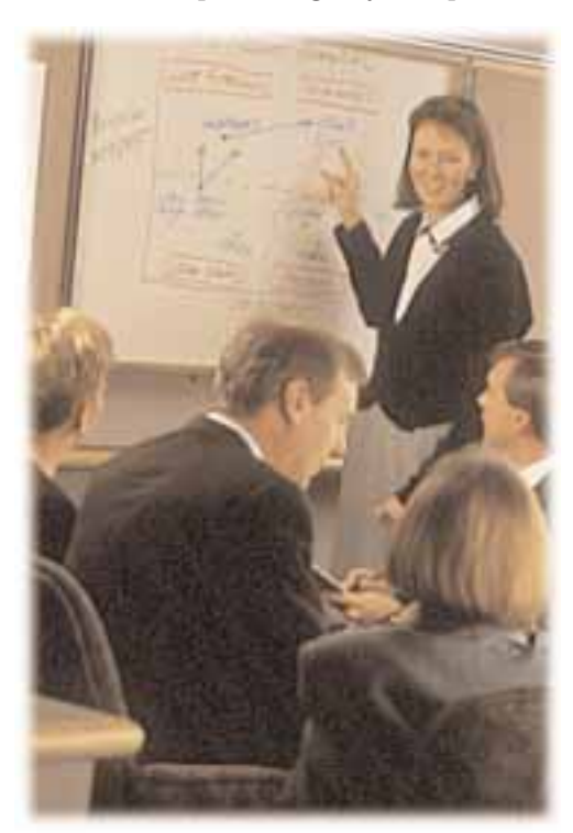
Custom Research, Inc., Malcolm Baldrige National Quality Award Recipient, 1996

One promising way to tap into the nation's small and mid-sized companies is through