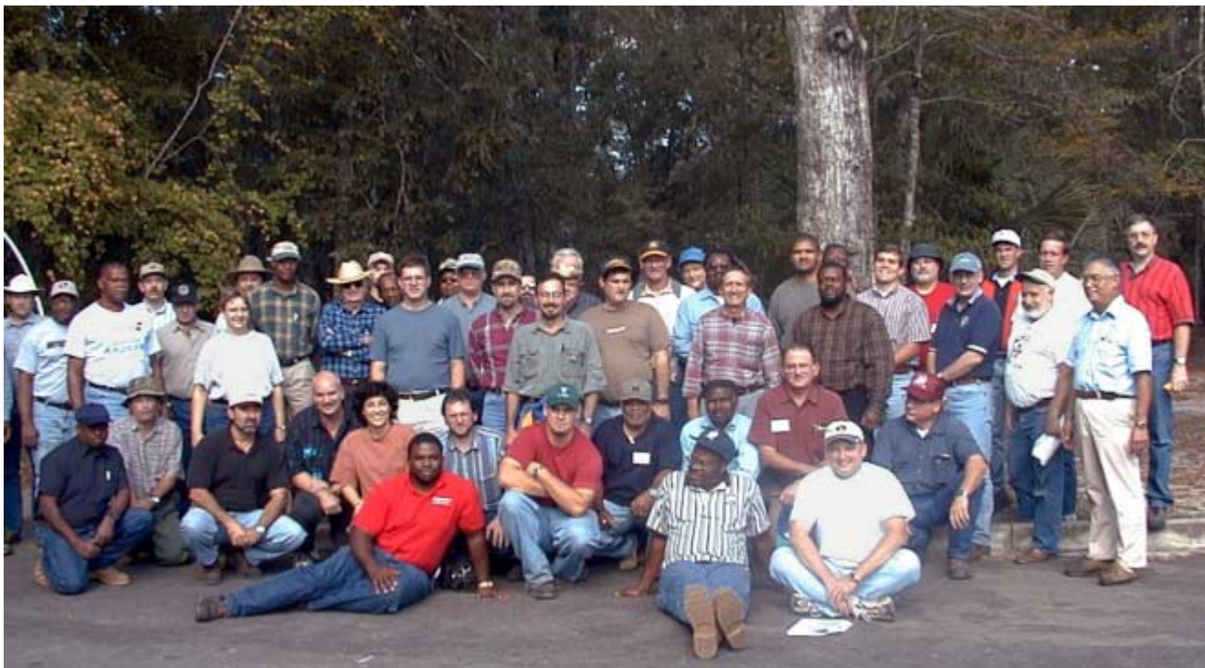
Figure 1.—The soil scientists and instructors who participated in the MO-15 Soil Scientist's Workshop held on the University of Florida campus in Gainesville, Florida.