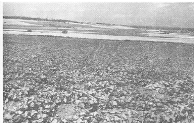
Figure 6.-Squash and a small grain growing on Coupeville silt loam, 0 to 2 percent slopes, on Ebeyes Prairie.

Use and suitability. -Except that it requires more careful drainage and tillage, this soil is managed in about the same way as Coupeville loam, 0 to 3 percent slopes (fig. 6). The