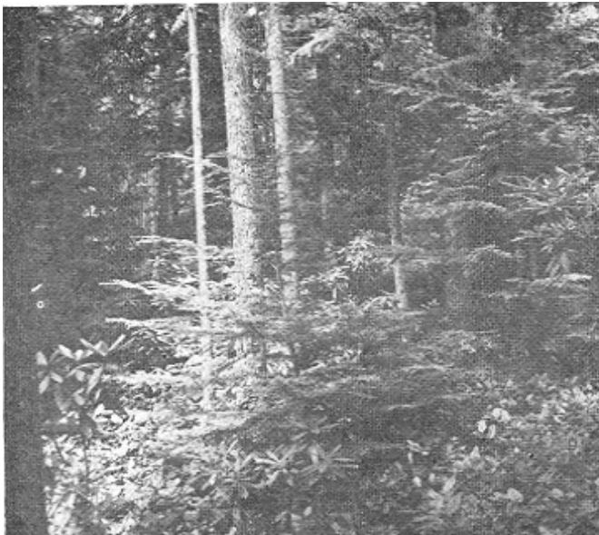
Figure 2.-A forest in Island County. The trees are mainly Douglas-fir and hemlock; the undergrowth is salal, Oregon grape, fern, huckleberry, and rhododendron.

Most of the area that is now Island County was once covered by dense forests. The forests were mainly Douglas-fir, but western hemlock and western redcedar were associated with the fir (fig. 2). The proportion