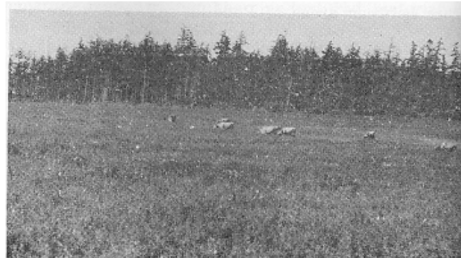
Figure 4.-Alfalfa pasture and forest on Casey loam, 0 to 5 percent slopes. Because of their low fertility and the high cost of clearing, many areas of Casey loam are still under forest.

Use and suitability. -About 70 percent of this soil has been cleared, and the rest is covered by trees and brush. Parts of the wooded areas are used as woodland pasture. The soil has a high water-holding capacity, but cultivation is difficult. It is better suited to pasture or to growing hay and grass for seed than to grain and row crops (fig. 4). The farms are generally dairy farms.