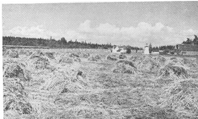
Figure 3.-Mixed grass-and-clover hay on Bow loam, 0 to 5 percent slopes. The field will be pastured after the second cutting.

Use and suitability. -Because of its favorable relief, good water-holding capacity, and fair to moderate fertility, most of this soil is in farms. About half is cultivated, and the rest is in woodland pasture or trees. The cultivated areas are used principally for pasture and for hay crops in conjunction with dairying (fig).