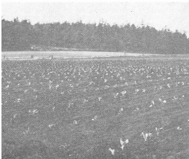
Figure 7.-Cabbage being grown for seed on Coveland loam, 0 to 5 percent slopes. Forests in the background are on Whidbey gravelly sandy loam, 5 to 15 percent slopes.

Use and suitability. -This soil is one of the most productive agricultural soils in the county (fig. 7). Its high content of organic matter and good supply of