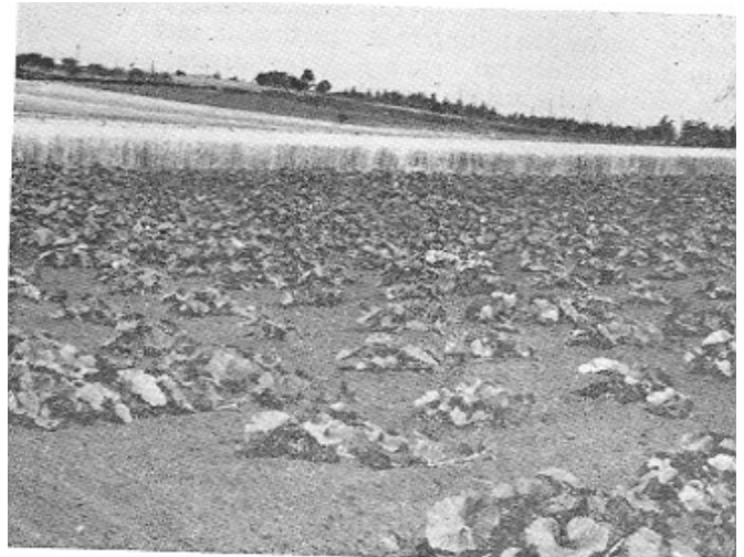
Figure 5.-Squash growing on Coupeville loam, 0 to 3 percent slopes. The field in the background is in winter wheat.

Prairie has been harvested by turkeys. Half-grown to full-grown turkeys, put in the fields when the wheat is nearly ripe, will leave practically no grain in the fields. This practice reduces the cost of feeding the turkeys and eliminates the expense of harvesting. In addition organic matter from the straw and turkey droppings is added to the soil.