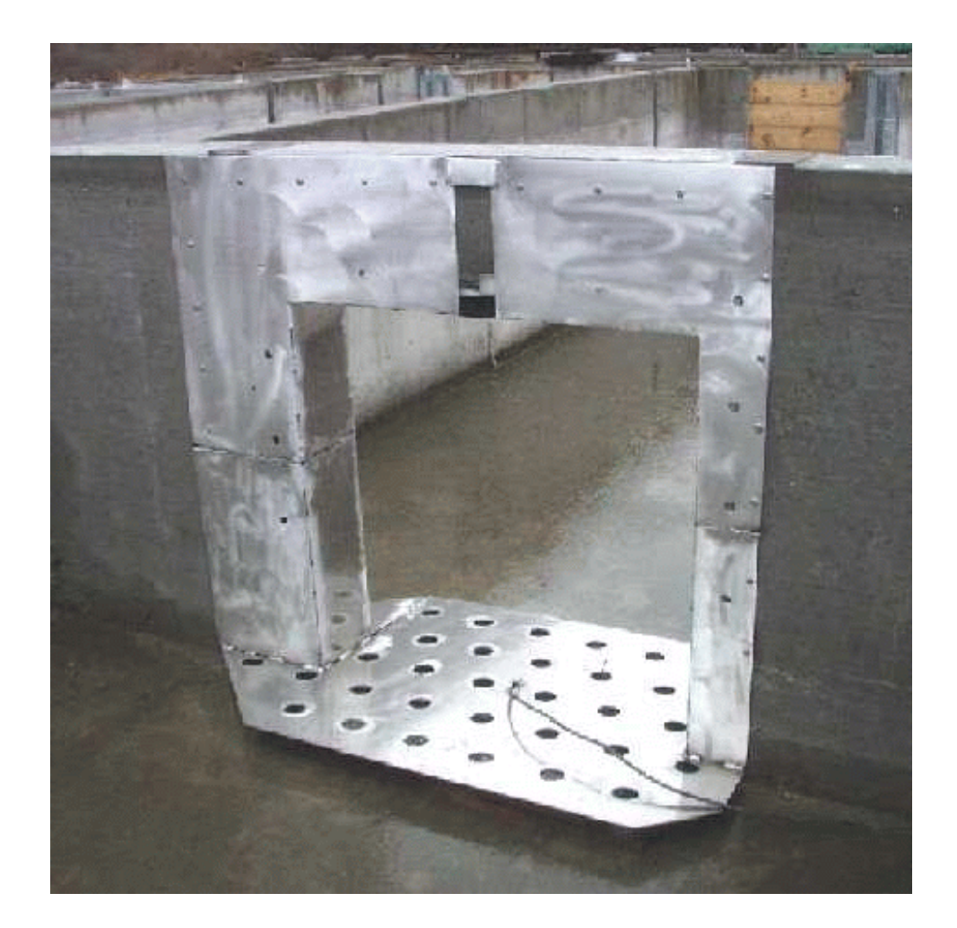
Figure 2. Photo of the alternate continuous RF shield (note welded strip at the top of the shield) that will be installed into the fish ladders during FY01. When shields are installed at the dams, the floor sections will be 8 inches beneath the fish ladder floor (not flush with the floor as shown in the photo).