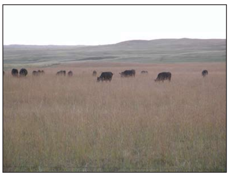
'Bison' big bluestem being grazed at the NDSU Central Grasslands Research Extension Center in central North Dakota.

Yield and quality of big bluestem forage will vary depending on soils, moisture, and management. Average, oven-dried, annual yields from NRCS test plots in North Dakota, South Dakota, and Minnesota varied from approximately 3,000 pounds per acre to over 7,000 pounds per acre with no fertilization. The application of nitrogen fertilizer and more than one harvest can greatly increase production. Crude protein