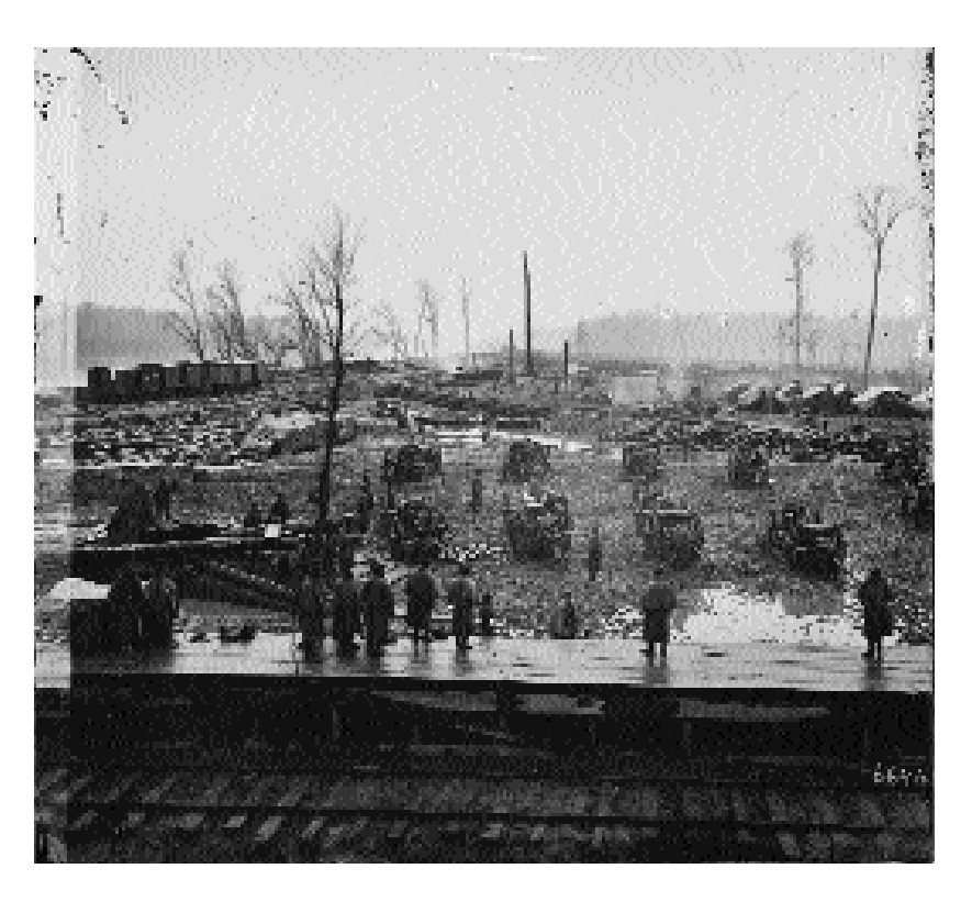
FIGURE 5 Until recent decades, African American contributions to the North's war effort received little public attention. Yet following the Emancipation Proclamation, nearly 180,000 blacks enlisted in the United States Army, including the troops shown here at a war-torn battleground in west-central Tennessee in 1864.

Union army. It is estimated that nearly 180,000 blacks joined the United States Army before the end of the war, more than half of them recruited from the Confederate states. They served mainly in infantry, cavalry, and heavy and light artillery units.