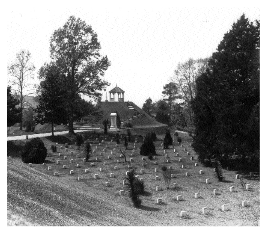
FIGURE 3 The national cemetery concept emerged during the Civil War to provide for the proper care of thousands of Union dead. Like formal military cemeteries on other Civil War battlefields, Vicksburg National Cemetery, established in 1866 and shown here ca. 1905, was gracefully landscaped to honor the Union soldiers and sailors buried there. Confederate dead were interred elsewhere, many of them in the Vicksburg city cemetery.

After the war ended, a systematic effort to care for the Northern dead led to the creation of many more military cemeteries, most of them established under the authority of congressional legislation approved in February 1867. This legislation strengthened the 1862 legal foundation for national cemeteries—for instance, by reauthorizing the purchase of lands needed for burying places; providing for the use of the government's power of eminent domain when necessary for acquiring private lands; and calling for the reimbursement of owners whose lands had been, or would be, expropriated for military cemetery sites. The total number of national cemeteries rose from 14 at the end of the war to 73 by 1870, when the re-burial program for Union soldiers was considered essentially completed. Although many of the new official burial grounds were on battlefields or military posts, others were part of existing private or city cemeteries. Also, two prominent battlefield cemeteries that had been created and managed by states were transferred to the War Department: Pennsylvania ceded the Gettysburg cemetery in 1872, and Maryland transferred the Antietam cemetery five years later.<sup>17</sup>