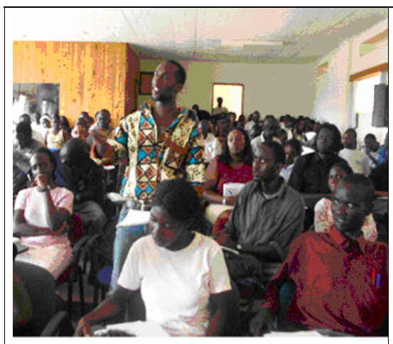
_A student of Nkozi University seeks further clarification on competitiveness at one of the competitiveness public lectures that took place at Nkozi University during the year.