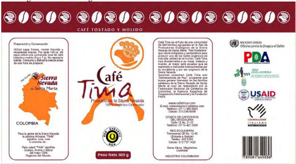
Design of coffee package for Red Ecolsierra-UN-CFDP Project.

The marketing package for the project's coffee and honey were also developed and the UN has begun commercialization efforts for other non-FGB beneficiaries associated with the project. Once CFDP's FGB beneficiaries begin production, they will be able to take advantage of this marketing outlet.