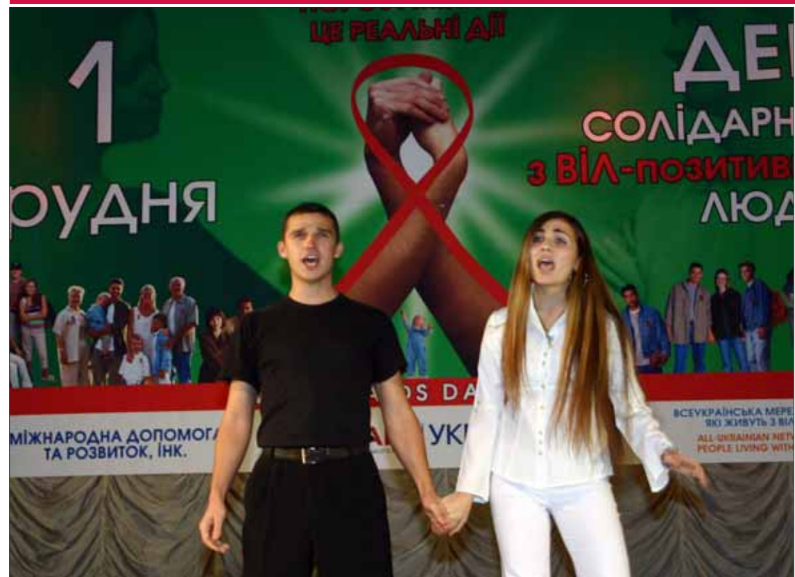
A scene from Understand! Assist! Support!, the mini-musical, performed on the World AIDS Day - December 1, 2005

s we join with our friends in remembering those who have suffered with HIV/AIDS on December 1, World AIDS Day, it is important not only to think about the threat which HIV/AIDS poses for