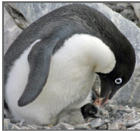
An Adie penguin tends to her chick near Palmer Station.

Some more advances of the late 1970's and early 1980's include the transportation of live krill back to home laboratories, which was successful due to temperature