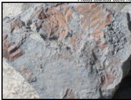
Right, leaf fossils collected by Allan Ashworth's group.

would push up through the dirt and re-establish, leaving concentric layers representing the sediment and growth patterns.