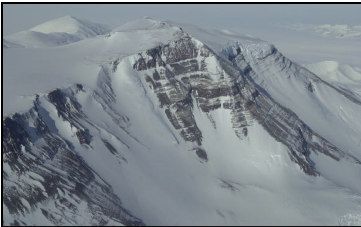
Layers of rock show the periods of time near the Beardmore Glacier.