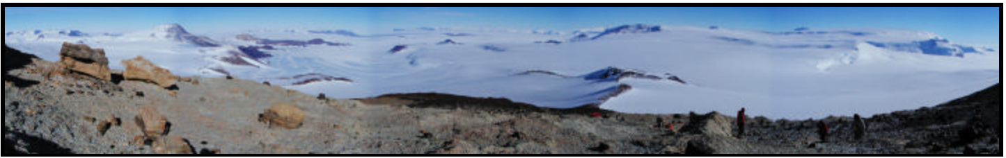
Paleontologists search for dinosaur bones at a site on Mt. Kirkpatrick.