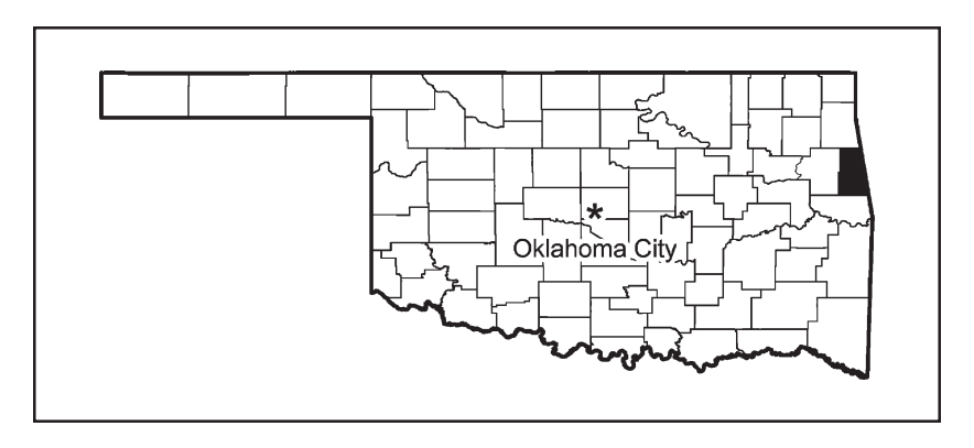
Figure 1.—Location of Adair County in Oklahoma.

Agriculture and related services are important in Adair County. The chief sources of income are the sale of poultry, livestock, and related products. Strawberries and peaches are important horticultural products produced in the area. Corn, small grains, grain sorghum, and improved grasses and legumes for hay are grown mostly as feed