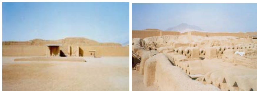
Images of Chan Chan archaeological site.