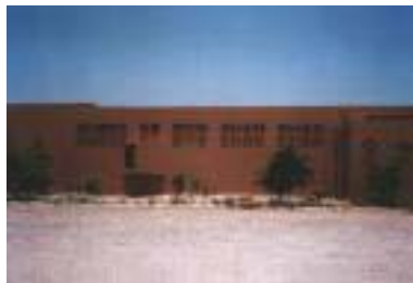
Chan Chan site museum entrance.