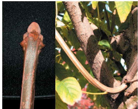
Figure 7. Left, blue ash bud, and right, square twig.

Blue ash is commonly found on dry upland limestone sites in Ohio. It is considered a medium-sized tree with the distinctive characteristic of having twigs that appear to be square. The wings that grow on the twigs give the tree its square twig-identifying characteristic (Figure 7). The bark of blue ash is shaggier in appearance than any of the other three ashes described here.