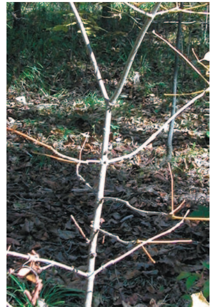
Figure 1. Opposite branching on a young ash tree.

Differentiating between the four species of ash that are commonly found in Ohio isn't easy. However, there are some key characteristics to look for that will help you determine which ash you are examining.