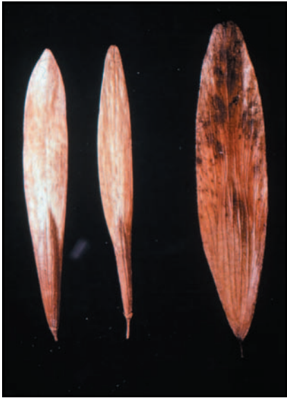
Figure 3. Ash samara — white, green, and black ash (left to right).