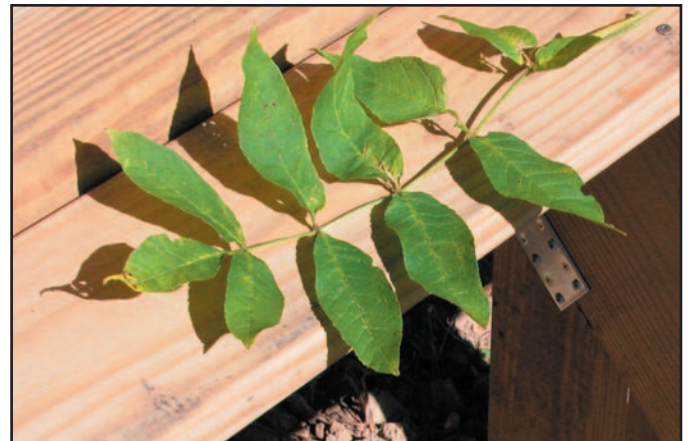
Figure 2. Pinnately compound ash leaf with 11 leaflets.

The ash as a genus lose their leaves in the fall, are opposite in both the branching pattern and how the leaves are attached, have pinnately compound leaves with leaflets that have either smooth