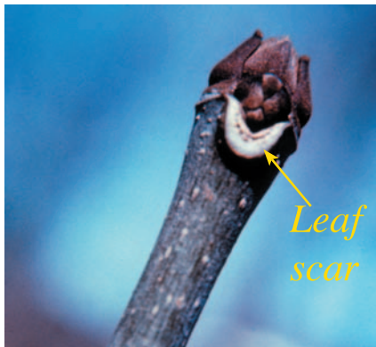
Figure 4. White ash smiling leaf scar.

White ash is the most common of the four ashes found in Ohio. It is more of an upland tree, with little tolerance for growing in wet areas. One of the differentiating characteristics between it and the other ashes is the scar that a fallen leaf leaves behind. The leaf scar on white ash has more of a grin to it than do the other ashes (Figure 4).