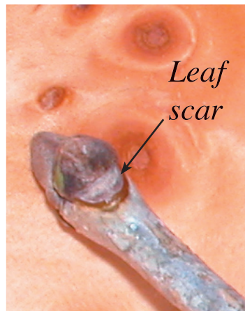
Figure 5. Green ash bud and leaf scar.

Green ash can be found in a wide variety of sites across the state, but its natural habitat is more poorly drained soils, usually along streams, in bottom lands, and throughout wet woods. When comparing the leaf scar of green ash to that of white, the scar on green ash appears to be more like a semicircle with a flat line across the top (Figure 5).