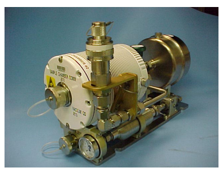
Figure 3.—Sample processing unit.

The flight hardware consists of a sample processing unit (SPU); an electronics control unit (ECU); a base plate; and sundry electrical harnesses, data cables, and vacuum hoses. The SPU (figure 3) incorporates the