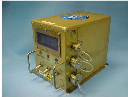
Figure 4.—Electronics control unit.

tains the power regulator, display, and computer circuit boards that control the experiment. The flight hardware will operate in the MSG (figure 5) on top of the Glovebox Integrated Microgravity Isolation Technology (g-LIMIT). The MSG will provide power, vacuum, cooling, and containment for the CSLM-2 experi-