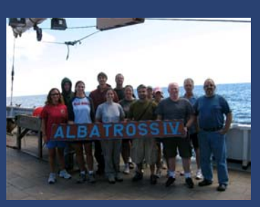
2007 Autumm Bottom Trawl