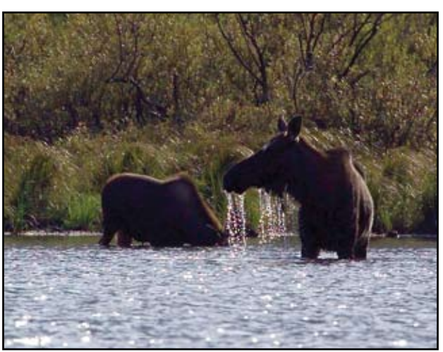
Moose cow and calf at Kootenai Lakes

Note: American citizens, legal residents of the United States and Canadian citizens with proper documentation ONLY, on all hikes leaving from Goat Haunt.