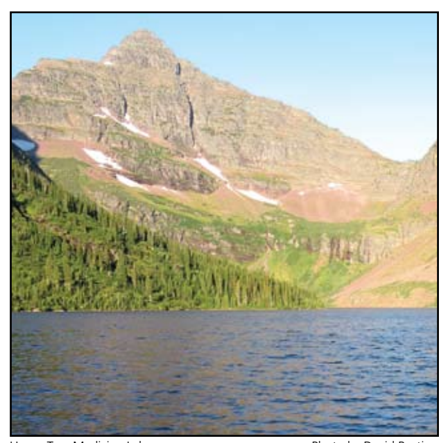
Upper Two Medicine Lake