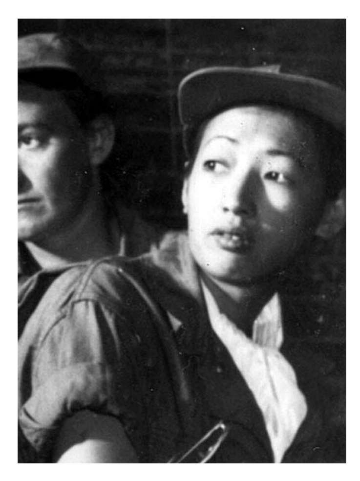
Hazel Ying Lee

In September 1942, the Army Air Force (AAF) created the Women's Auxiliary Ferrying Squadron (WAFS), later named the Women Air Force Service Pilots, and appointed Nancy H. Love its commander. The highly skilled female pilots recruited by Love were sent on noncombat missions ferrying planes between factories and AAF installations. The Air Force also set up a Women's Flying Training Detachment, and eventually more than 1,000 women completed flight training. The women were considered Civil Service employees of the AAFS WAFS/WASP.