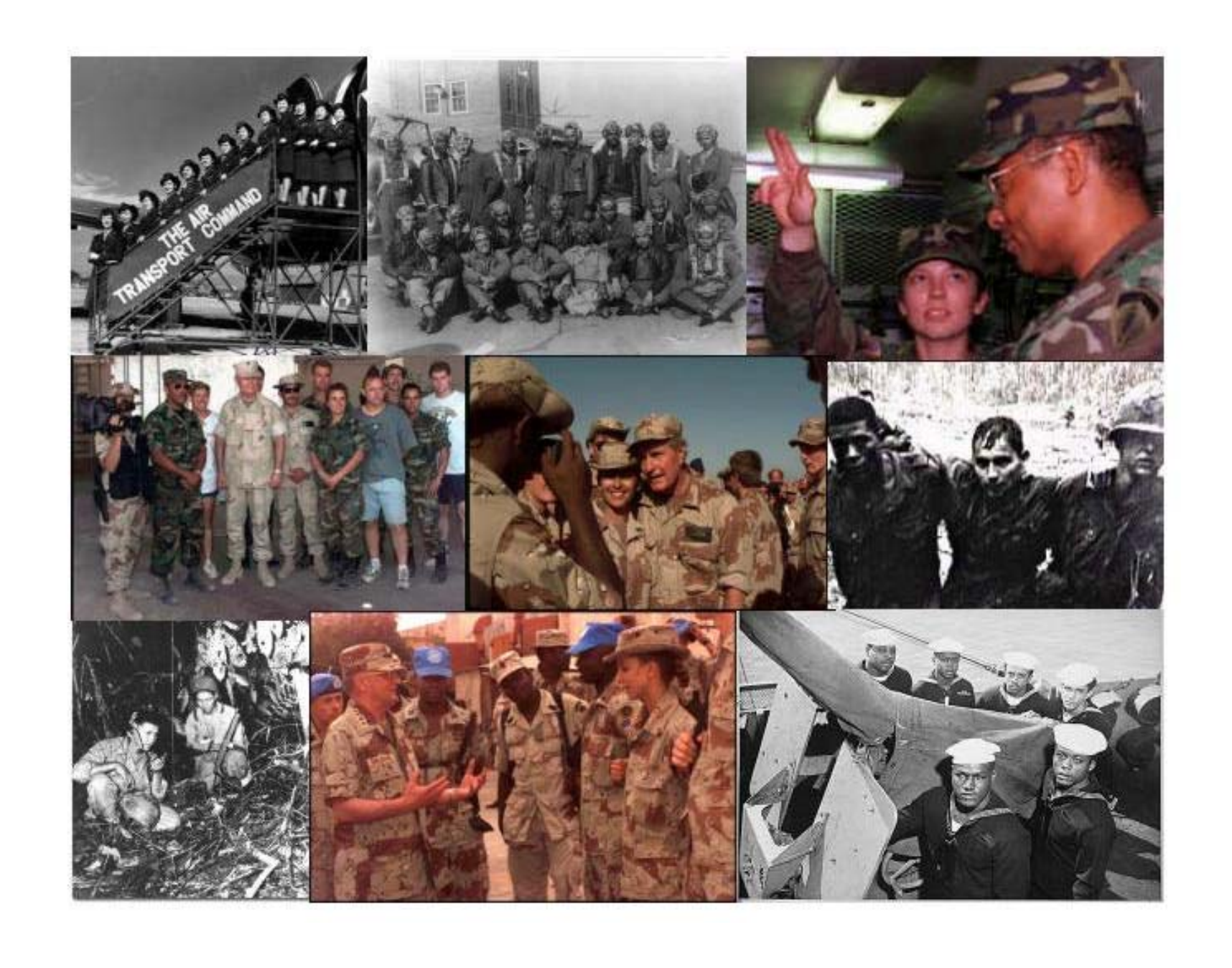
Multiculturalism in the Armed Forces in the 20<sup>th</sup> Century