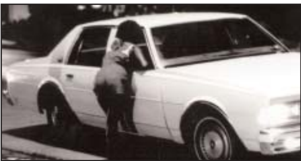
Street prostitution thrives along roads where prostitutes can talk to drivers from the curbside.