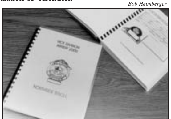
Habitual street prostitutes are usually well-known to police vice units.

Identifying and targeting the worst offenders. A small percentage of prostitutes and pimps may be responsible for most of the complaints in a prostitution area. If you can establish this, you might more productively target your efforts at those few, rather than at the larger population of offenders.