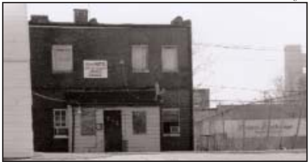
Street prostitution often thrives in areas where there are cheap motels and hotels.