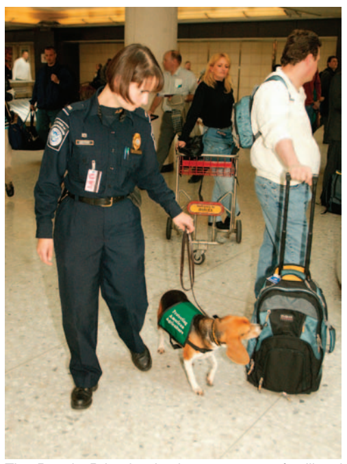
The Beagle Brigade checks passengers for illegal food products.

CBP screens 100 percent of cargo entering our seaports, and all cargo that is identified as a potential threat is inspected using large x-ray and radiation detection equipment. The CBP strategy is to rule out potential threats before arrival at our borders and ports. This year, 6 percent of total cargo containers were identified as potential threats and were physically inspected immediately upon arrival. CBP manages both the Container Security Initiative and the Customs Trade Partnership Against Terrorism. Both programs aim to secure containers in the early stages of shipping, before they arrive in the United States. The 2006 Budget in-