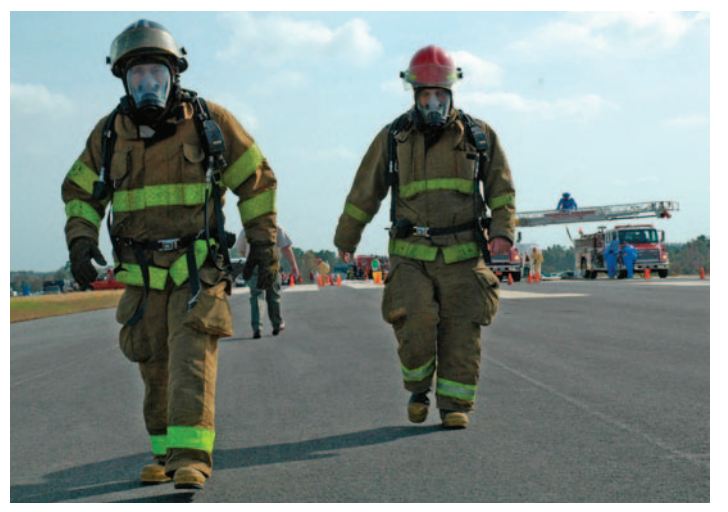
Emergency responders in Texarkana, Texas, participate in a full-scale exercise of the community's preparedness for responding to terrorism incidents involving weapons of mass destruction. The exercise was conducted by the National Emergency Response and Rescue Training Center, which is part of the National Domestic Preparedness Consortium.

In the event of a large-scale mass casualty attack in one or more cities, existing health care providers could be overwhelmed. While DHS will remain responsible for immediate medical response capabilities, Department of Health and Human Services will support additional mass casualty capabilities, including the purchase and storage of deployable care units consisting of beds and medical supplies in order to provide care for days or weeks, if necessary. The Budget also supports pre-event licensure and credentialing of qualified health care providers to ensure that they will be ready in the case of a mass casualty incident.