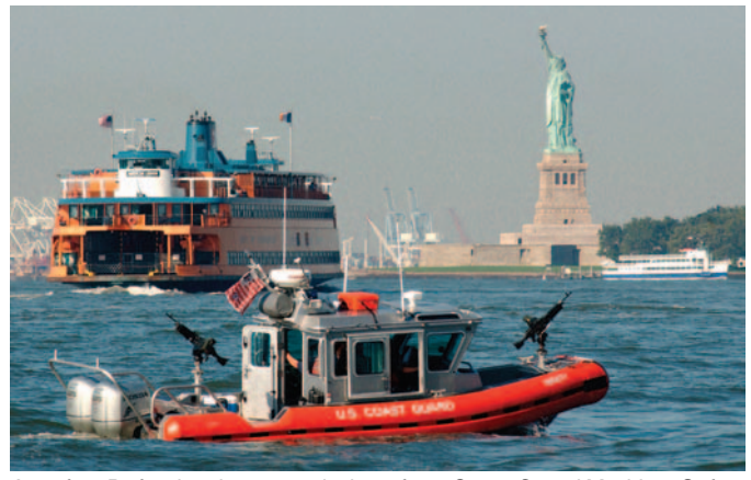
A 25-foot Defender class security boat from Coast Guard Maritime Safety and Security Team 91106 keeps watch over passenger vessels and high profile landmarks in New York Harbor.

EPA coordinates protection of the Nation's drinking water and water treatment systems. The 2006 Budget proposes $44 million to support the initial deployment in five cities of an early warning system, called Water Sentinel, to detect terrorist attacks on drinking water systems and a laboratory network to support water surveillance and emergency response.