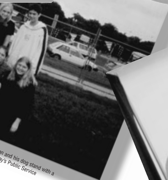
...n and his dog stand with a ...y's Public Service