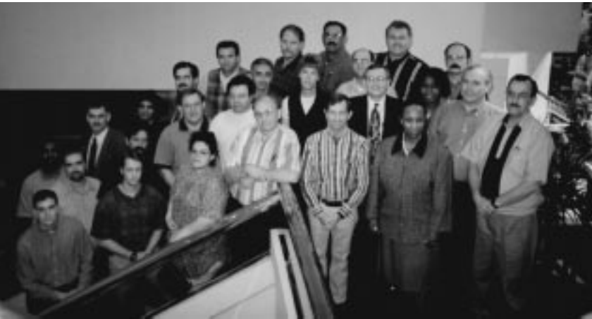
EOSH Division conference participants stand together during a break in the proceedings.

The Headquarters Environmental Occupational Safety and Health (EOSH) Division sponsored INS' second annual Safety and Occupational Health