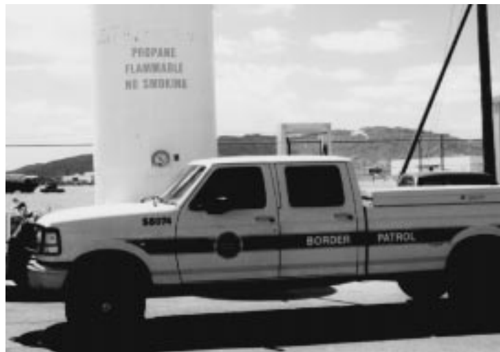
One of 25 propane-fueled vehicles currently being used by the El Paso Border Patrol sector.

Propane was chosen over electricity as the alternative fuel of choice, Mosier said, because while the electric vehicles the sector tested had “extremely good acceleration and a top speed of 75 miles per hour,” they also needed to be recharged after just 60 miles of field use. The other drawback was the long-term cost of purchasing electric vehicles. While they are virtually maintenance-free, the initial cost of the plug-in models begins at $35,000 apiece.