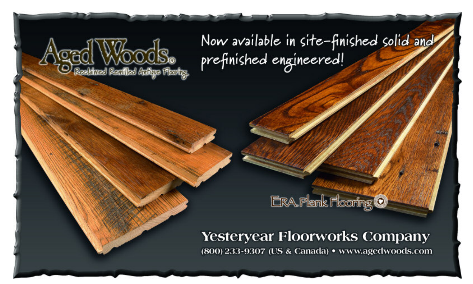
CIRCLE NO. 26 / www.eco-webcard.com