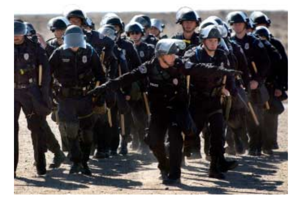
FIRST RESPONDER EXERCISE — APD crowd control personnel demonstrate unit maneuvers they would use in responding to a civil disturbance.