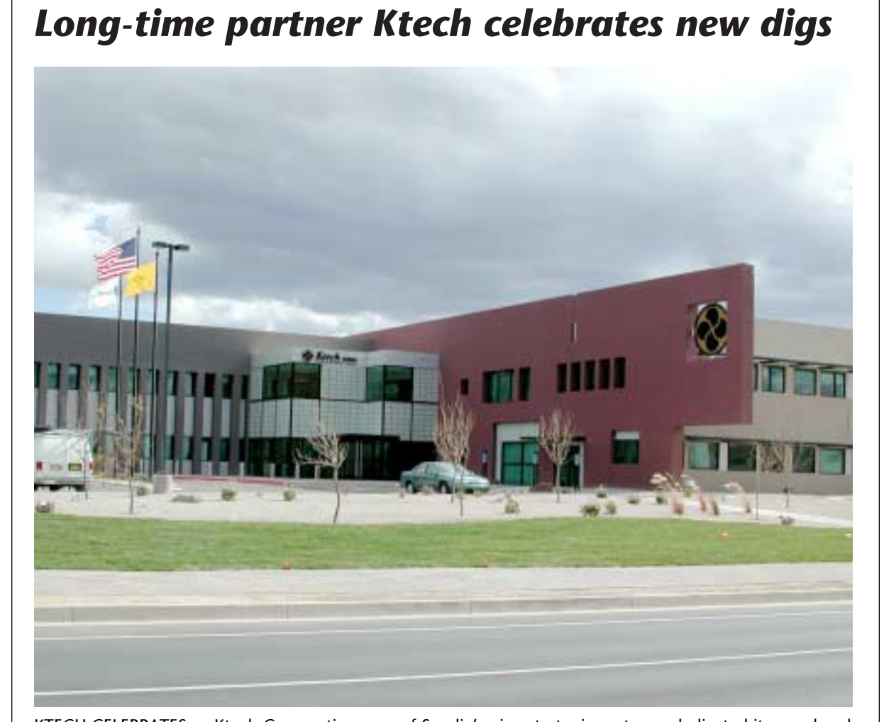
KTECH CELEBRATES — Ktech Corporation, one of Sandia's nine strategic partners, dedicated its new headquarters and celebrated the company's growth, achievements, and commitment on Nov. 6. The new 83,400-square-foot headquarters is situated on five acres at the corner of Eubank and Gibson adjacent to Albuquerque's Sandia Science and Technology Park. Ktech employs more than 390 people, of whom 200 work at Sandia. Ktech was founded in 1971 as a research and engineering firm focusing on the study and simulation of nuclear weapons effects. Ktech is a leader in highly specialized areas such as pulsed power, polymer research, and cold spray technology with both government and commercial applications. Ktech built Sandia's Z accelerator in the mid-1990s.

he worked on parametric measurements, circuit