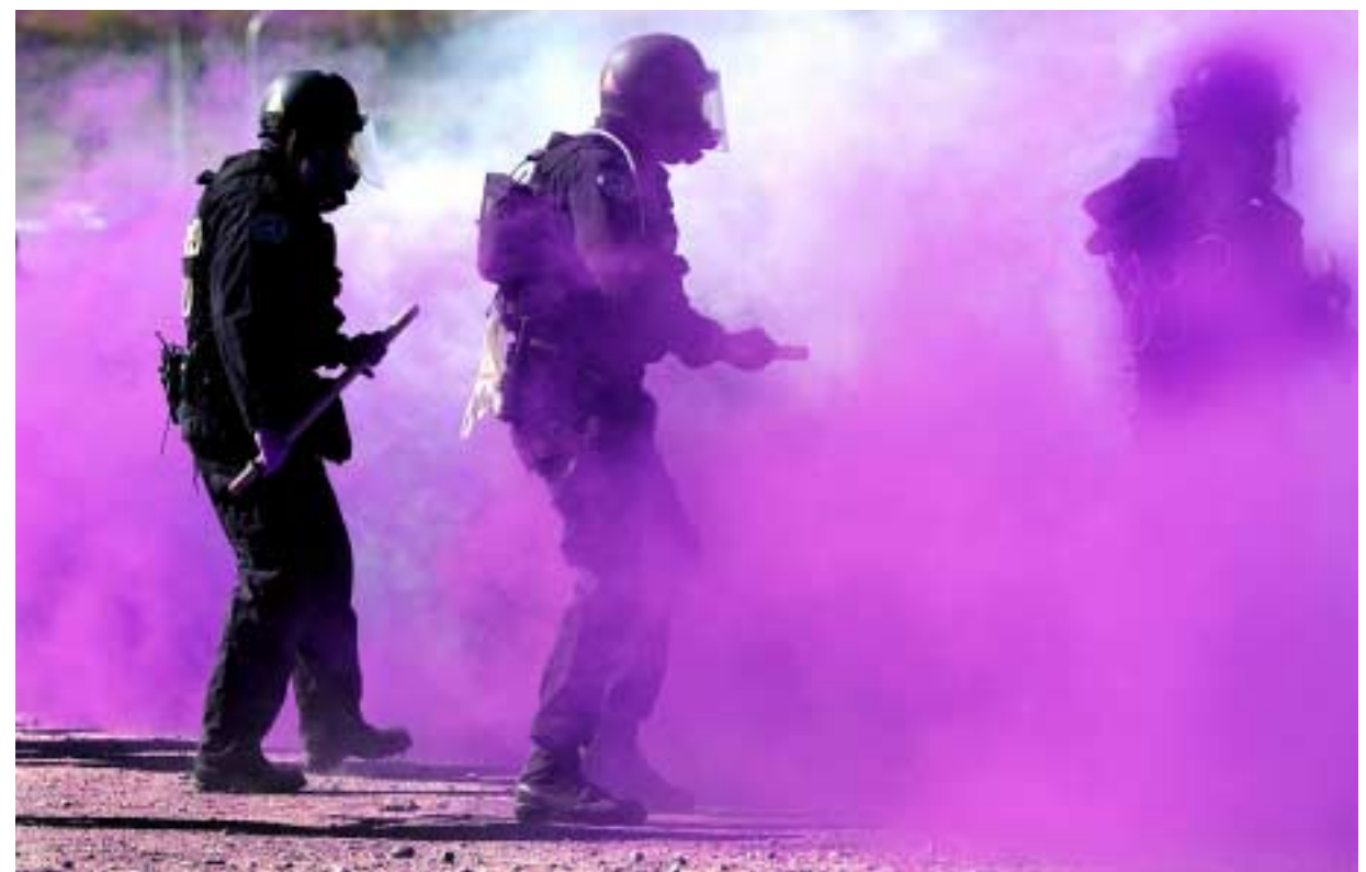
SIMULATED EFFECTS — Members of the Albuquerque Police Department (APD) enter a plume of simulated smoke used for crowd control.