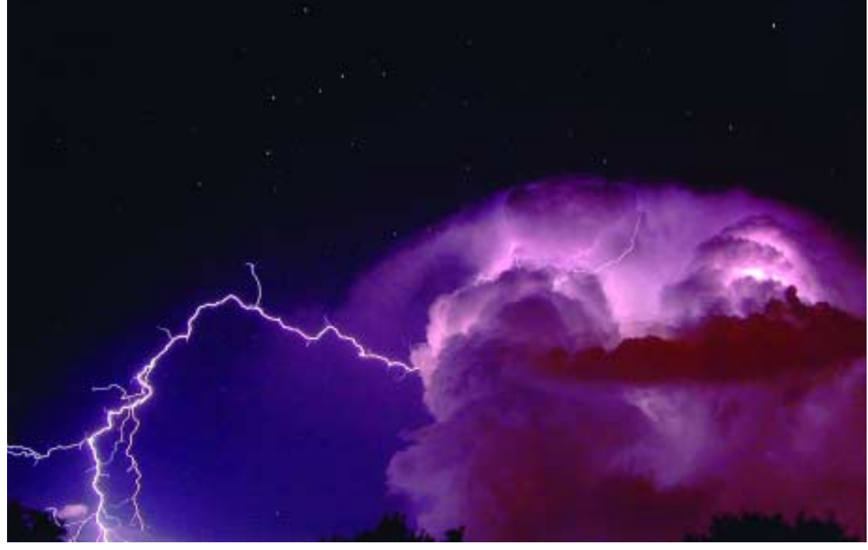
SANDIAN RANDALL ROBERT's Best in Show image of a lightning storm and the constellation Cassiopeia. You might be able to just see W-shaped Cassiopeia in the center left of the sky (it shows up faintly but clearly in the digital file).

Randall's photo and the other selected 25 images are on display through February 2004 at the LodeStar Astronomy Center, located in the New Mexico Museum of Natural History & Science in Old Town Albuquerque. The exhibit is open daily from 9 a.m. to 5 p.m. and is included with LodeStar admission.