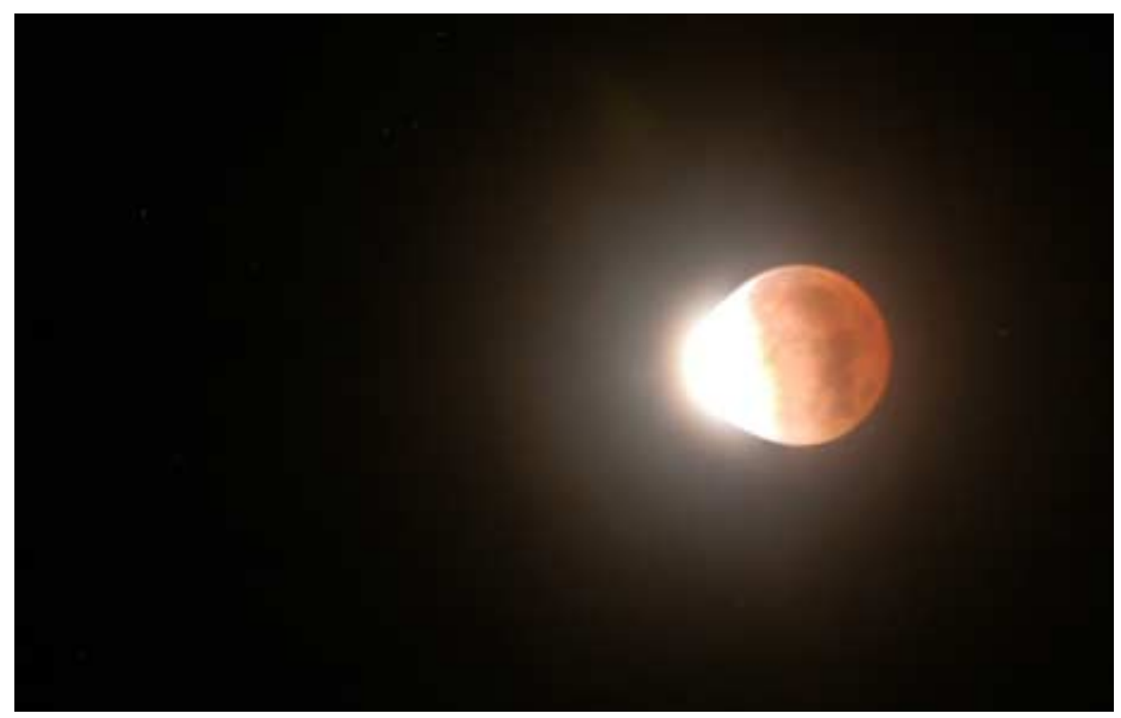
LAB NEWS PHOTOGRAPHER Randy Montoya captured the Nov. 8 lunar eclipse in this half-second exposure.