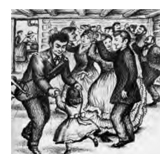
Illustration by Garth Williams © 1953; Little House in the Big Woods , published 1953 by HarperTrophy

From this rousing pamphlet that helped ignite patriotic passion in 1776, we can glimpse what the Pursuit of Happiness meant to the Revolutionary generation.