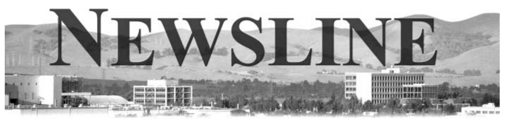
Published weekly for employees of Lawrence Livermore National Laboratory