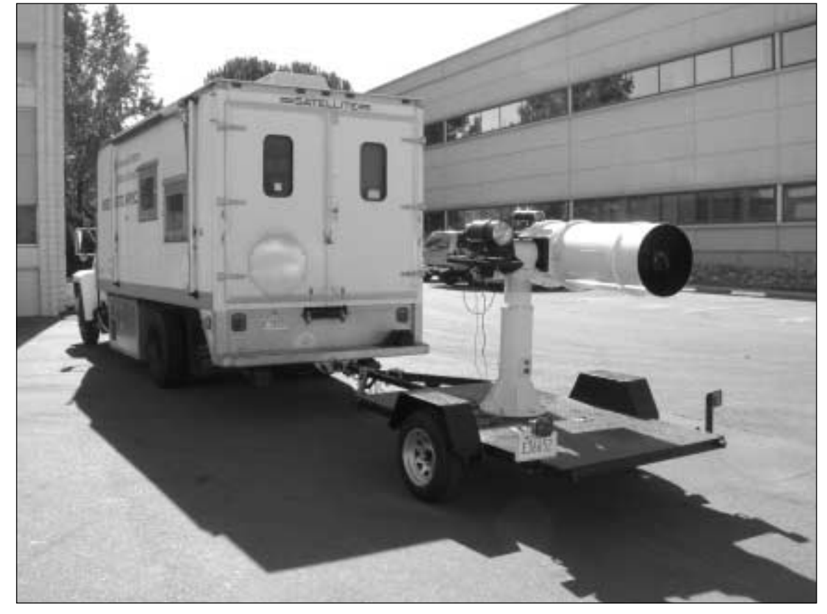
To develop a wireless means of transmitting large quantities of data, Lab scientists and engineers use the SATRN relocatable transceiver and the SATRN commmand and control van to conduct communications experiments between Mount Diablo and the Laboratory.

This assimilation of information is increasingly difficult as tactical and strategic reconnaissance and surveillance assets become more sophisticated and develop greater capabilities,