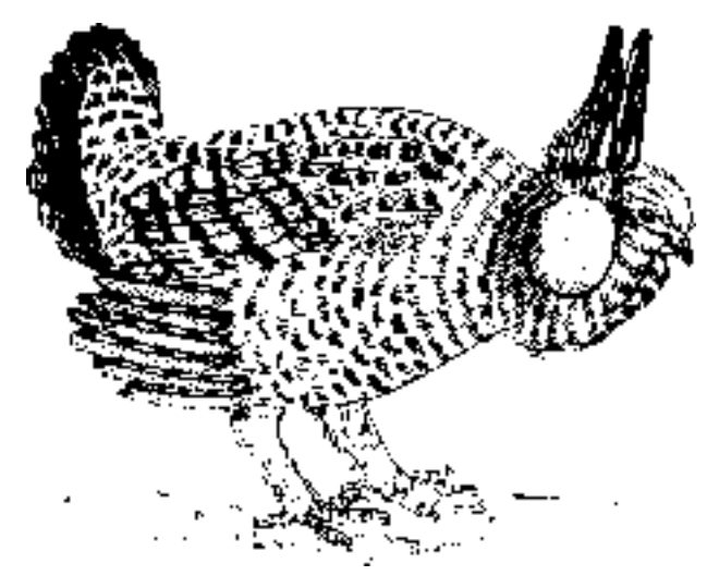
Prairie Chicken © Cindie Brunner