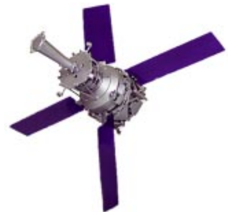
Gravity Probe B

The writer, an employee of ASRI, supports the Media Relations Department.