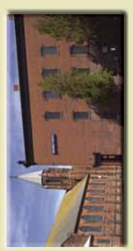
ig stand and the Union Build trance to Fifth Street St. Anne's Church and th sentinel at the entrance

Use caution when crossing streets • Watch for uneven or slippery surfaces • Please remain on sidewalks or paths • Do not enter vacant buildings. • Most buildings • Most buildings are privately owned. Please respect private property