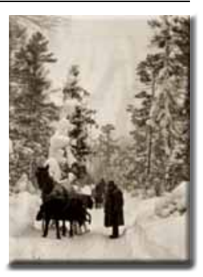
A forested trail outside the Village of Red Jacket shows some of the conditions that area residents faced during winter in the late 1800s.

These early copper prospectors found a land isolated from the rest of the world nearly six months out of the year by heavy snowfall and the tumultuous Lake Superior. While they certainly found adventure, few found anything resembling fortune. Most individuals would not strike it rich here. Instead, investors and businessmen from large Eastern cities funded mining ventures. These large copper mines needed workers, and workers needed places to live. Red Jacket was one of those communities, developing alongside the Calumet & Hecla Mining Company. Copper's call would soon turn the village into the "Queen of the Copper Country."