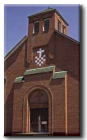
Once the place of worship for Red Jacket's Croatian Roman Catholic community, St. John the Baptist Church was deconsecrated in 1966 after the area's Croatian population declined.

An Italian musician entertains family members.