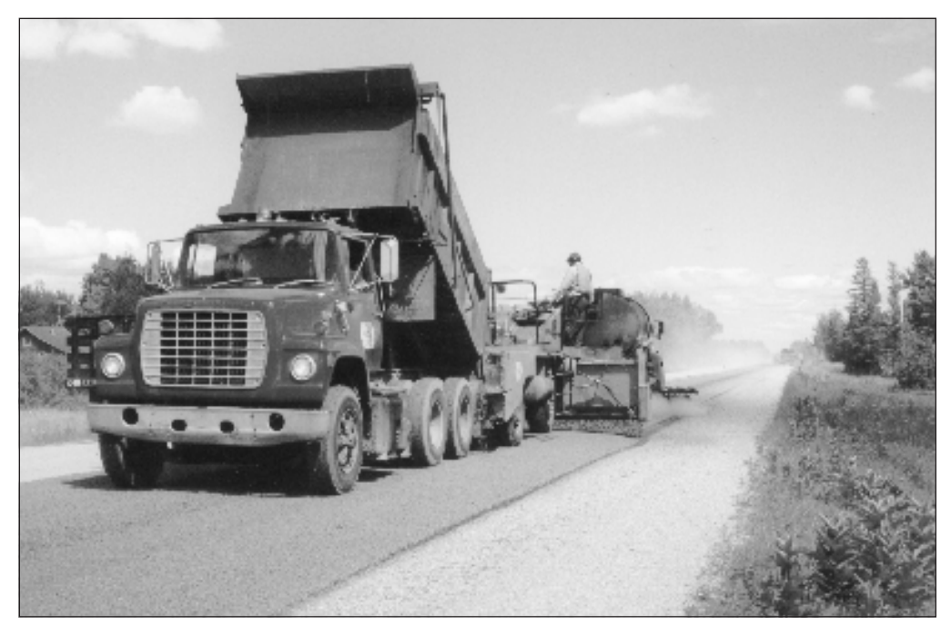
Michigan DOT relies on a wide variety of preventive maintenance treatments to extend the life of its pavements. Here, a chip seal is applied.