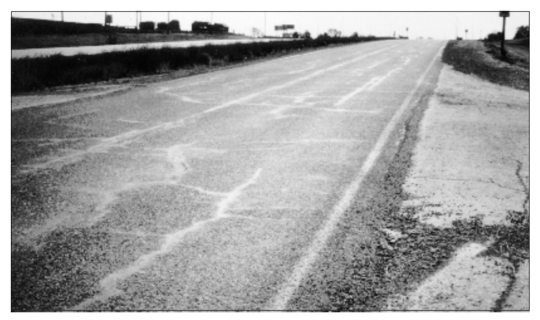
Kansas DOT applied chip seals and crack seals to Route 68 in Ottawa, producing one of the State's bestperforming pavements. The treatments were not only effective, but also very inexpensive.

Crack and chip seals are particularly important for the open-graded and semiopen-graded asphalt concrete mixes some