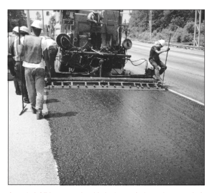
Georgia DOT has recently added microsurfacing to its arsenal of preventive maintenance treatments.

Georgia DOT treats about 10 percent of its pavements each year using a variety