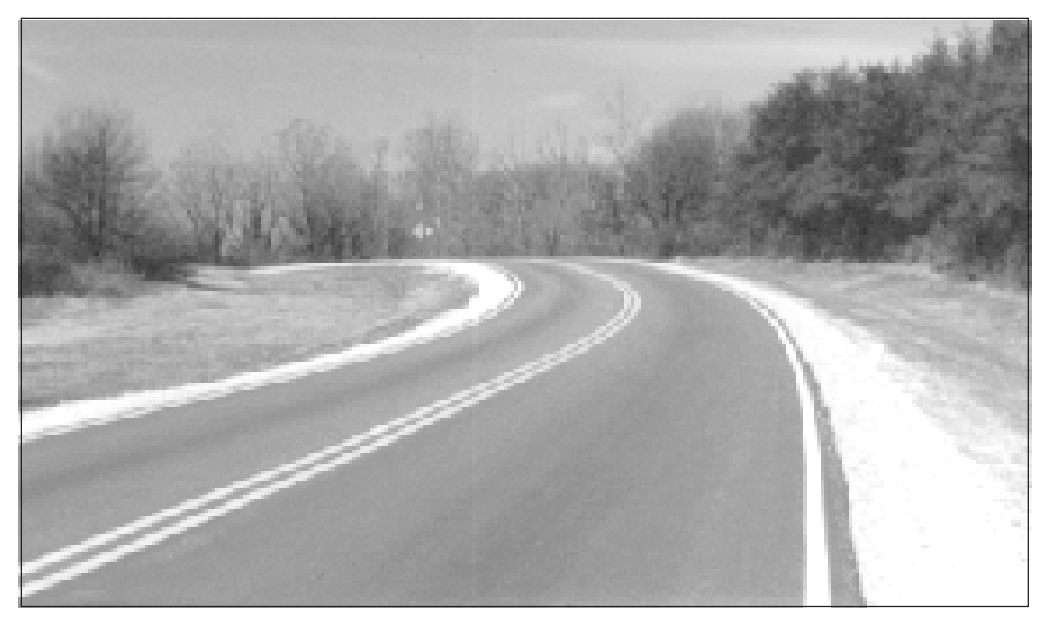
The end result of proper pavement preservation is a highway with an extended service life—thus saving funds—and a highway that provides a more consistent, better overall ride quality.