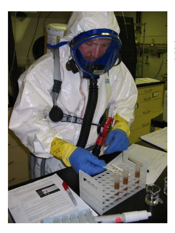
Figure 6-2. Testing of the OP-Stick Sensor with the Non-Technical Operator Wearing PPE

Figure 6-1. Side View of PPE Worn by Non-Technical Operator