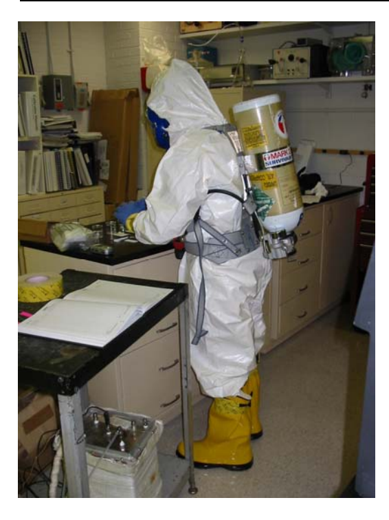
Figure 6-1. Side View of PPE Worn by Non-Technical Operator