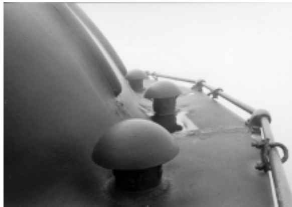
Figure 17. Roof vents such as these should be inspected for leaks and maintained during the mothballing period. This shroud-style vent allows air to pass while preventing rain from entering.