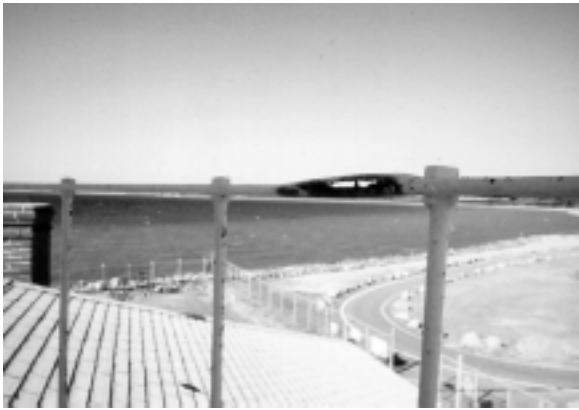
Figure 26. Detail of handrail that is being deformed by rust-jacking.