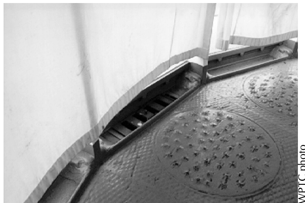
Figure 23. As part of the lantern mothballing treatment the lantern glass sill vents should be kept open (except in extremely damp climates) to allow for the free flow of air through the lantern.

air within the lantern will create a chimney effect as the warm air rises that will help maintain an ambient temperature and humidity within the lantern. The chimney effect will also aid in the ventilation of the