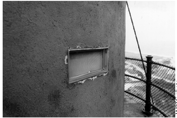
Figure 27. This lantern vent opening has been covered with a fine stainless steel screen that prevents insect infiltration while maximizing air movement through the vent and into the lantern.