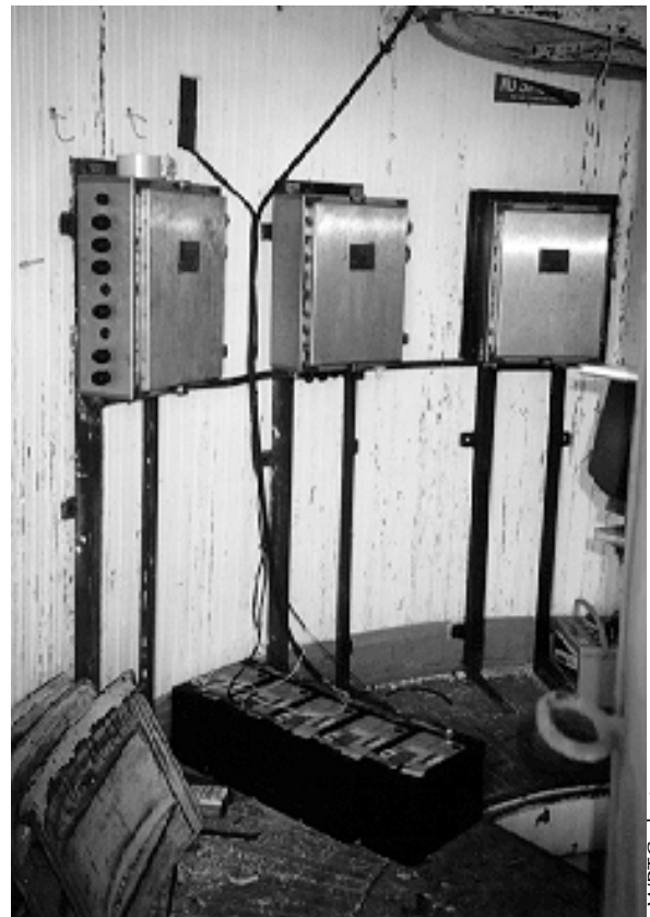
Figure 33. To minimize damage to historic wood beadboard panelling, these new panels should have been installed on a sheet of plywood attached to the historic wood beadboard panelling in four locations. These batteries stored on the floor should be in containment boxes in case the batteries leak.

Many historic lighthouses have been upgraded to either alternating current (AC) or solar power during the conversion to automatic operation. During this conversion various pieces of equipment