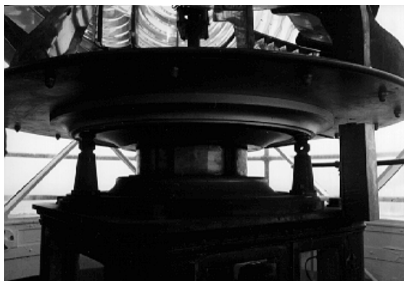
Figure 36. This c. 1926 lens was designed to be AC powered; the original lens jacks are still in place. The three jacks (the third is obscured by the brass bearing cover) were used to lift the lens assembly so that bearings could be serviced.