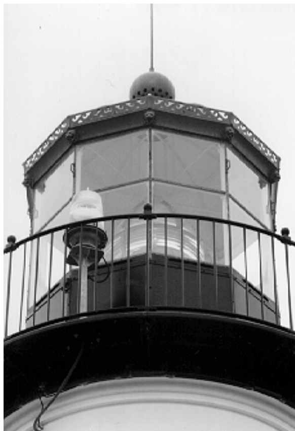
Figure 35. This is an acceptable auxiliary light installation. The light is mounted on an aluminum pedestal that has been bolted to the replacement aluminum deck.