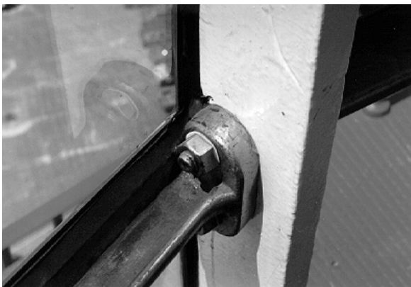
Figure 24. The stainless steel through bolts used to join this bronze sash bar to the vertical lantern post is isolated from the bronze using a nylon washer as a barrier.

damaged with a corrosion prohibiting primer and top coat.