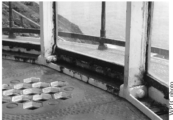
Figure 22. Close-up of sill vents in a first-order lantern. The vents should be kept open during the mothballing period to maximize lantern and tower ventilation.