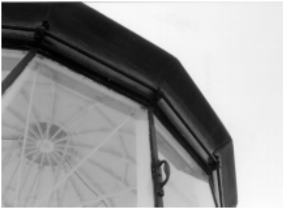
Figure 30. Close-up of a first-order lantern that retains its lantern glass; note the clarity.

added measure, a bead of clear silicone caulk may be applied to the exterior side of the window/frame joint to shed water away from the joint.