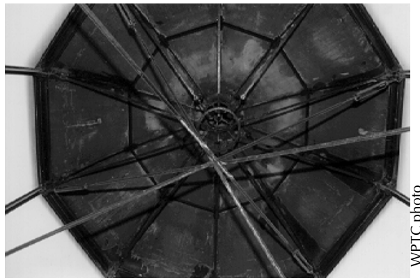
Figure 21. The diagonal tension rods in this empty lantern were installed to brace the lantern against lateral loading caused by high winds.

During any preservation treatment the vents should remain operable to allow the maximum amount of air flow through the lantern. To prevent pest infiltration, the exterior openings of the vents should be screened with fine brass or stainless steel screen. When vents are kept open, natural convection caused by sunlight heating the