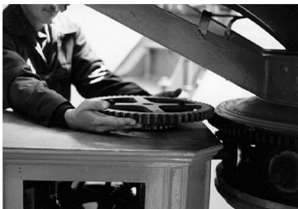
Figure 34. When this first-order classical lens was converted to AC power, the original drive gear (pictured here) was the crank used to wind the clockworks.