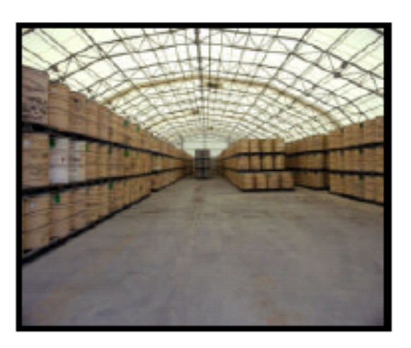
Figure.1 TRU Waste Before and After Retrieval.

As part of the retrieval program, all these containers were processed through the Drum Vent and Purge system, where radiolytic gas (primarily hydrogen) and other gasses such as methane and volatile organic compounds (VOC's) were vented and a carbon filter inserted to prevent the recurrence of gas accumulation. To date some 25,000 drums have been processed through this system (including non-retrieved drums).