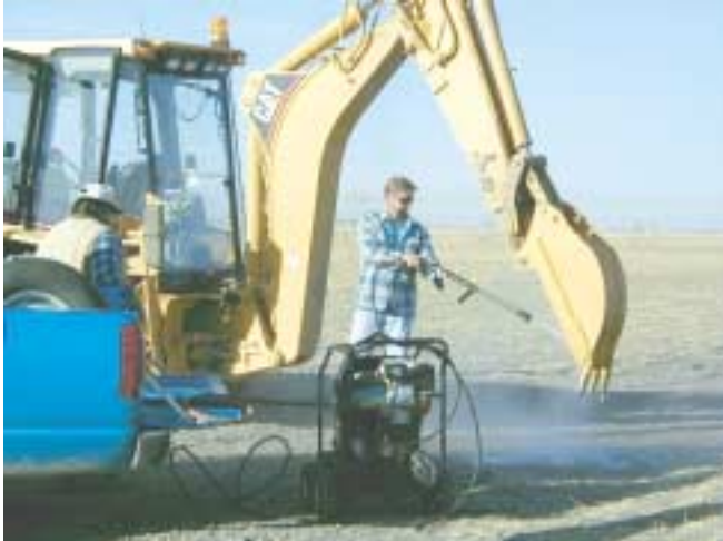
Figure 4. Backhoe blade being cleaned with a hot-water, high-pressure sprayer, October 1999, Fort Hall, Idaho

high-pressure sprayer before each trench was dug (fig. 4). Trenches were dug to a depth of about 3.5 to 4 ft; the face at the front edge of the trench was relatively vertical (fig. 5). Global Positioning System (GPS) measurements were made at trench sites to document locations of the trenches. Trenches were constructed in approximately the same areas as for earlier sampling events (but not the same locations) in an effort to duplicate soil conditions while avoiding use of previously disturbed soil.