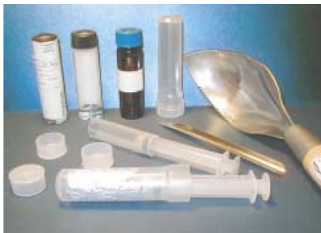
Figure 3. A set of soil sampling supplies.

A team of personnel from the USGS, Idaho Soil Conservation Commission, NRCS, Shoshone-Bannock Tribes, Idaho Department of Agriculture, and Western Agricultural Research collected the soil samples. The backhoe blade was cleaned with a hot-water,