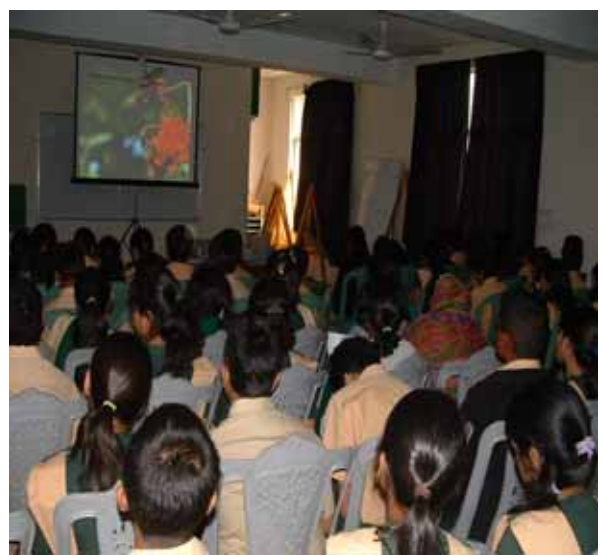
Students of Aga Khan School is watching NSP movie

4<sup>th</sup> School Outreach program was held for two consecutive days on 27<sup>th</sup> and 28<sup>th</sup> February at Sir John Wilson School in Gulshan2. In total Nishorgo reached out to 90 students from class seven and eight in the same mode of outreach as done in the other schools. During the interactive discussion carried by the NSP staffs, the students were very participative and keen in learning of the Natural Heritages of Bangladesh. They answered questions intelligently and gave out brilliant ideas on how they can contribute to conservation practices. One said he would write in the Daily newspaper about his new learning and aware people to protect forests. Another said she would tell her parents to arrange their family outings at one of Nishorgo's Sites, so that she can spread the awareness first among his family members.