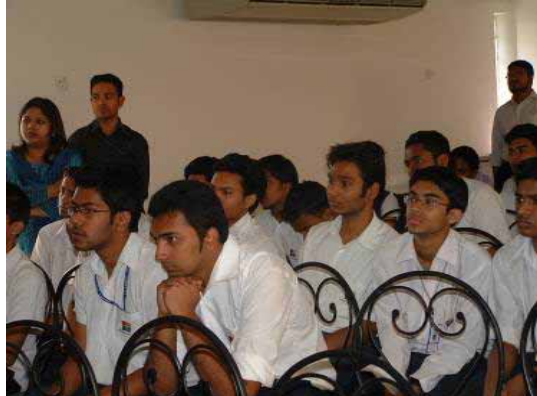
Students engrossed in listening to scout member sharing his views at Scholastica