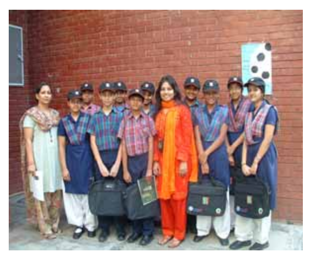
Quiz winners pose wearing NSPcaps at SJW.