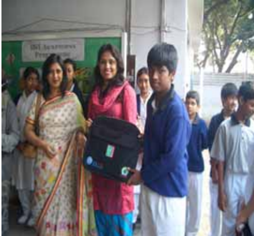
Nishorgo Staffs giving out Quiz Prizes at Sunbeams School.

The 3<sup>rd</sup> School Outreach was held in The Aga Khan School on 18<sup>th</sup> February with 75 middle school students aging between 11 to 13 plus.