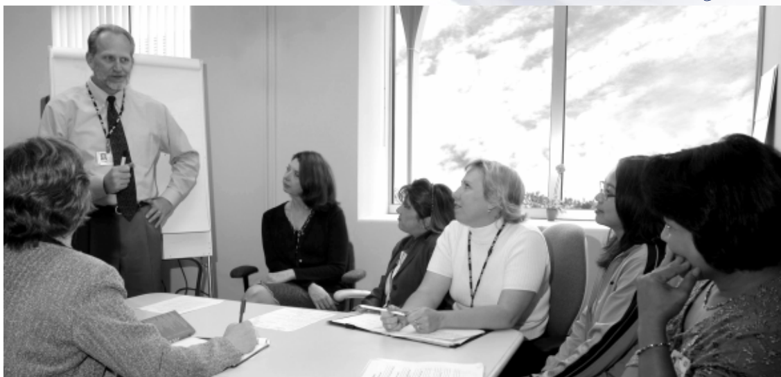
Health Plan Management, Leadership Team Training

Over the past three years Health Plan Management service line (HPM) has launched a Leadership Team Training process to allow HPM to deal effectively with the many frequent changes brought on by automation, legislation and changes within the healthcare industry. Specifically, the goals are: