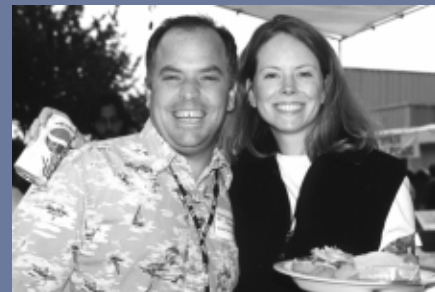
These satisfied VA Puget Sound employees enjoy fellowship and food at last year's picnic

August 8 th 10:30 am – 1:30 pm 6:30 pm – 8:00 pm August 9 th 1:30 am – 3:00 am