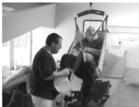
Ceiling Mounted Lift

In a review of injury statistics from the Bureau of Labor Statistics, health care workers are among the leading occupations at risk when considering job-related injuries. Back injuries in long-term care accounted for over fifty percent of the injuries. The National Institute for Occupational Safety and Health (NIOSH) studied the workload on the human back during a patient transfer from wheelchair to toilet. The average NIOSH action limit was calculated to be 19.8 pounds. This indicates that unless the patient can assist the health care worker so that no more than 19.8 pounds must be lifted for each nurse involved in the lift, the lift can be considered unsafe and places each health care worker at risk for injury.