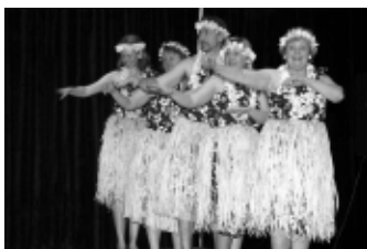
Doing the Hula VA hawaiian style