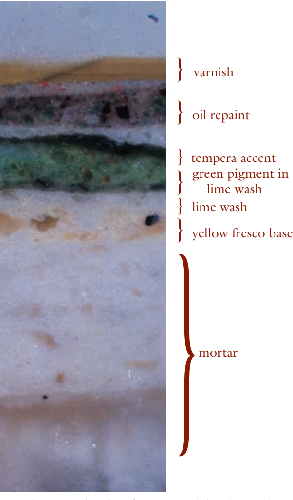
Fig. 15–7. Sample taken from a panel detail seen through a microscope. This photomicrograph shows the layers of mortar, lime wash fresco, and accent color, surmounted by several layers of repaint and heavy, yellow-tinted varnish.

Brumidi used primarily three different execution techniques on the walls and ceilings in the Senate corridors. First, the lunettes that Brumidi painted himself were executed in buon fresco , in which pigments moistened with water are applied to wet mortar and become incorporated