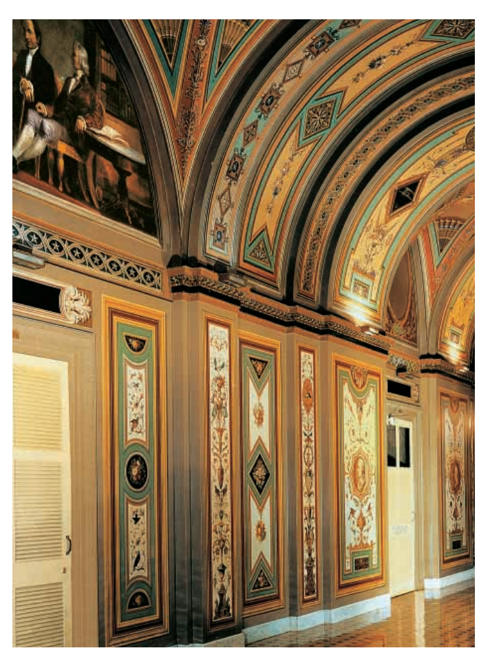
Fig. 15–4. Section of the North Corridor with computer enhancement. A computer-generated image predicts the appearance of the corridor when returned to its original colors. Note the airiness of the light panel backgrounds, the suggestion of stone structure in the walls, and the visual unity of wall and ceiling.

At the curator's request, we devised a restoration plan that will restore the corridors' original aesthetic character and safeguard them from future transformation through the use of techniques such as reflectance spectrophotometry. The restoration plan was approved by Congress, and