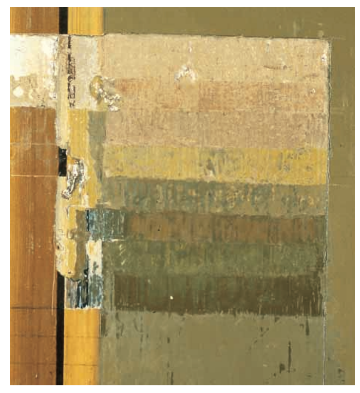
Fig. 15–6. Test window showing the gradual color shift in overpaint. This scala through layers of overpaint at the edge of the trompe l'oeil molding shows nine major paint layers. They shift from the lowest, original, layer of stony light gray to muddy green.

paint layers step by step) (fig. 15–6) confirms what one would expect: there was no sudden, dramatic change of color, but rather a gradual process of drift, which varied in different areas. For example, in the northern end of the Main Corridor, the wall panel surrounds are presently a chocolate color. Visually, this region now seems utterly unconnected to the adjacent North Corridor, but it originally had the same colors as the North and West Corridors.