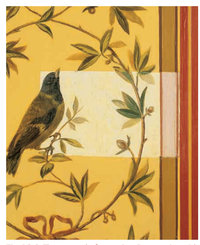
Fig. 15–2. Test removal of overpaint. In comparison with the overpainted areas, the original painting is higher in quality, with the details of the black-headed grosbeak and vine delicately and accurately painted on a white background.

he ornate decoration of the Brumidi Corridors has long dazzled visitors in its sheer complexity. The variety of motifs and the masterly compositions are tributes to Brumidi's skill and experience as an artist, historian, and designer (fig. 15–1). Yet, despite the years and highly skilled labor that Brumidi and his assistants devoted to its execution, the decoration that resulted appeared at best only extremely elaborate. We found it puzzling that the high quality of Brumidi's execution technique elsewhere was not evident throughout the corridor decoration, and that closeup, the minute details of the