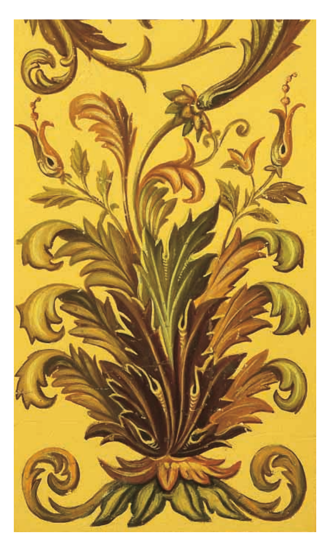
Fig. 15–9. Comparison of overpainted acanthus leaves. In the corridors, the acanthus leaves range from three-dimensional forms that appear to be growing (left) to crude and flat outlines resulting from heavy-handed overpainting.

On the overpainted surfaces, the stylistic drift can be seen in samples of acanthus, which appear frequently in the corridors. The drift is so conspicuous throughout the Senate wing that the painted acanthus leaves can be used as an indicator of the amount of change that has occurred in any section of the hallways since that section was first painted (fig. 15–9).