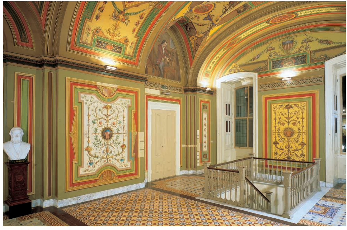
Fig. 15–5. Patent Corridor with two conserved panels. Exposure of the first large sections of original paint layers in the initial phase of the corridor restoration produced bright, limpid colors that dramatically contrast with the untreated panel to the right.