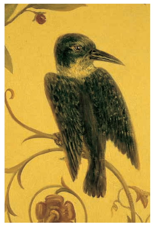
Fig. 15–10. Varied conditions of overpainted birds. The original birds of the corridors, such as the blue macaw at left, were painted with the accuracy of good ornithological illustration of the period. In areas subject to damage, birds have "mutated" through repainting. The belted kingfisher, for example, has lost its distinctive crest and gained a sparrow's tail.