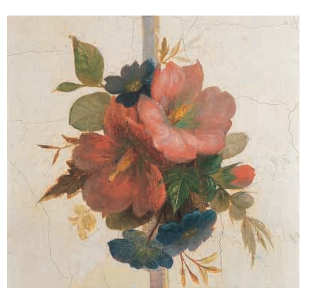
Fig. 15–11. Details of floral panel before and after conservation. The heavy oil overpainting of the uppermost layer (left) showed stiff, leaden flowers of unspecific character. Underneath them were found delicate and brilliant morning glories, poppies, and hibiscus (right) on the original paint layer, which needed only minor repair.