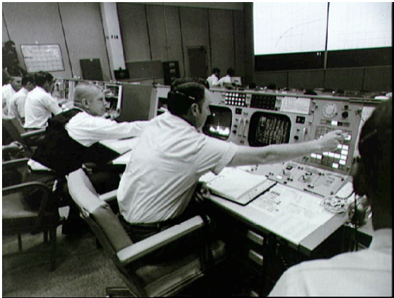
Apollo 11: Flight Director's console in the Mission Control Room during the launch of the Apollo 11 lunar landing mission.

Let us reflect on what we might want to learn from the Apollo lunar landing missions.