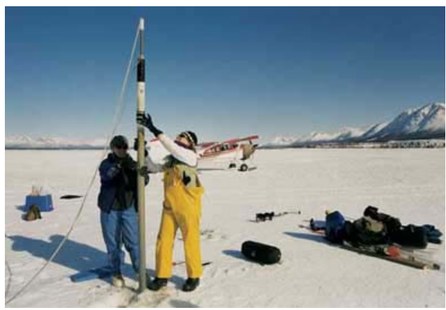
Researchers collect sediment cores through the ice at Lake Clark National Park and Preserve.

For further information on this research go to: <a href="http://www.absc.usgs.gov/research/Fisheries/Lake_Clark/overview.htm">http://www.absc.usgs.gov/research/Fisheries/Lake_Clark/overview.htm</a>