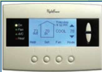
The NightBreeze system delivers conditioned air and brings cool nighttime air into the house.