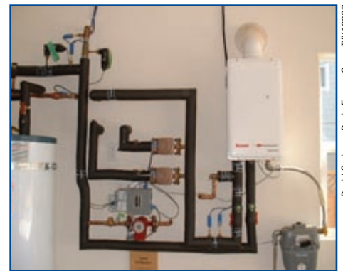
The solar storage tank is shown on the left. It is connected to solar collectors on the south-facing roof of the house. The white box is an instantaneous gas water heater that also supplies heat to the NightBreeze air handler for winter space heating; the two brown pumps circulate water to the two air handlers. The red pump circulates hot water to the kitchen and bathroom fixtures and is activated by motion sensors.

The experience in Livermore taught the builder how to integrate these energy efficiency systems into production buildings. According to Jeff Jacobs, project manager at Centex, "The Livermore house gave us the opportunity to learn how to integrate these systems into a mainstream options package for a production home. We are now ready to offer that package, which we call PowerSave, to the general public at Lunaria and Aventura in San Ramon."