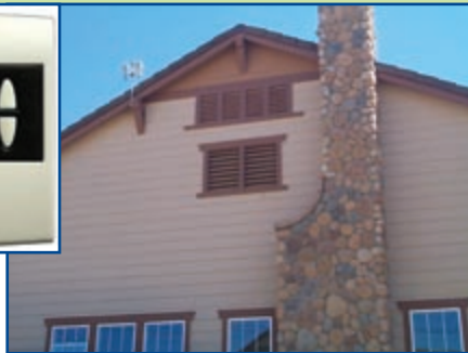
The NightBreeze system draws in outside air through the lower louvers (the upper are for attic ventilation). The device above the roof to the left measures outside air temperature, relative humidity, and solar radiation.

they like to check it periodically to see what they're using. If the use seems a bit high, they find something they can turn off to save energy. And they can also see how the photovoltaic system works: on a sunny day the solar cells can generate power; on a cloudy day or at night the house draws current from the electrical grid. From October 2002 through September 2003, the photovoltaic system generated 104% of the electrical energy the house needed.