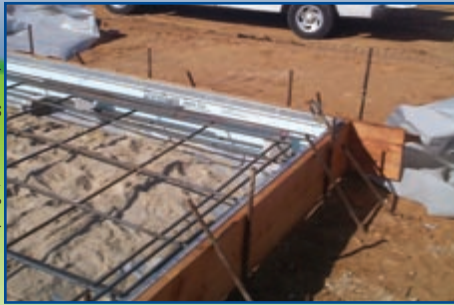
The edge of the slab is insulated with 1.5 inches of extruded polystyrene board. A steel flashing embedded in the concrete protects the top of the insulation and prevents termites from entering the wall.