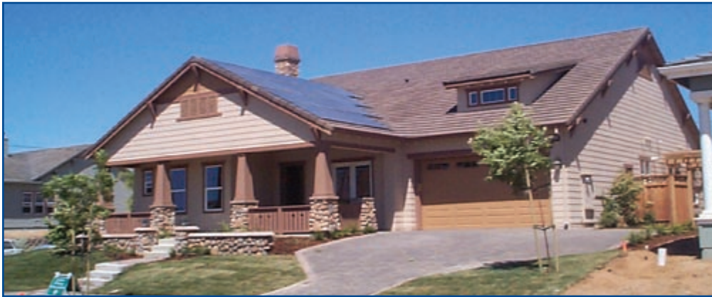
Southwest view of the Centex 21st Century Performance Home in Livermore shows 3.6-kW photovoltaic panels on the south-facing roof.