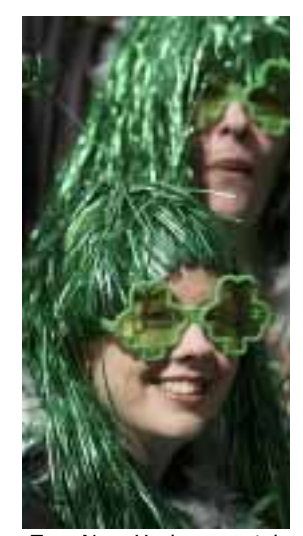
Two New Yorkers watch the 2005 Saint Patrick's Day Parade from behind green-tinted shamrock plasses

As the Globalization Index indicates, Ireland, ranked number 2, is a very globalized nation. But even centuries before globalization became a buzzword, the Irish did their part to connect with the rest of the world when they immigrated in large numbers to the United States. The effects of this immigration are still visible in the United States today - as for example, in the celebration of St. Patrick's Day on March 17, said to be the only national holiday observed outside its native land. The observance honors Bishop Patrick, born in England, who brought Christianity to Ireland in the fifth century, using a shamrock to illustrate divinity. The day has been marked in America since it was a colony. New York City's huge parade has taken place every year since 1762. The greatest number of Irish immigrants arrived in the U.S. in the middle of the 19th century, to escape hardships of a potato famine. Today, 34-million Americans claim Irish descent - more than eight times the population of Ireland itself. Irish is the nation's second most frequently reported ancestry, trailing only those of German ancestry.