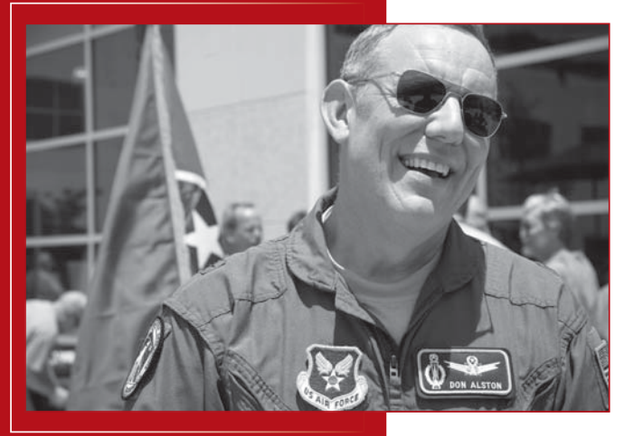
Maj. General (Sel.) Donald Alston, U.S. Air Force, congratulates Y-12 employees on the completion of the canned subassembly production for the B61 Life Extension Program.

The Y-12 National Security Complex has reached a major milestone in the National Nuclear Security Administration's (NNSA's) Stockpile Stewardship Program with completion of the canned subassembly production for the B61 Life Extension Program (LEP).