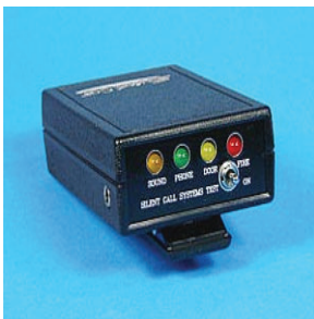
GOOD VIBS RECEIVER