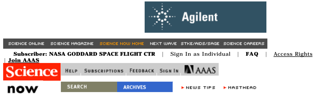
2 July 2003