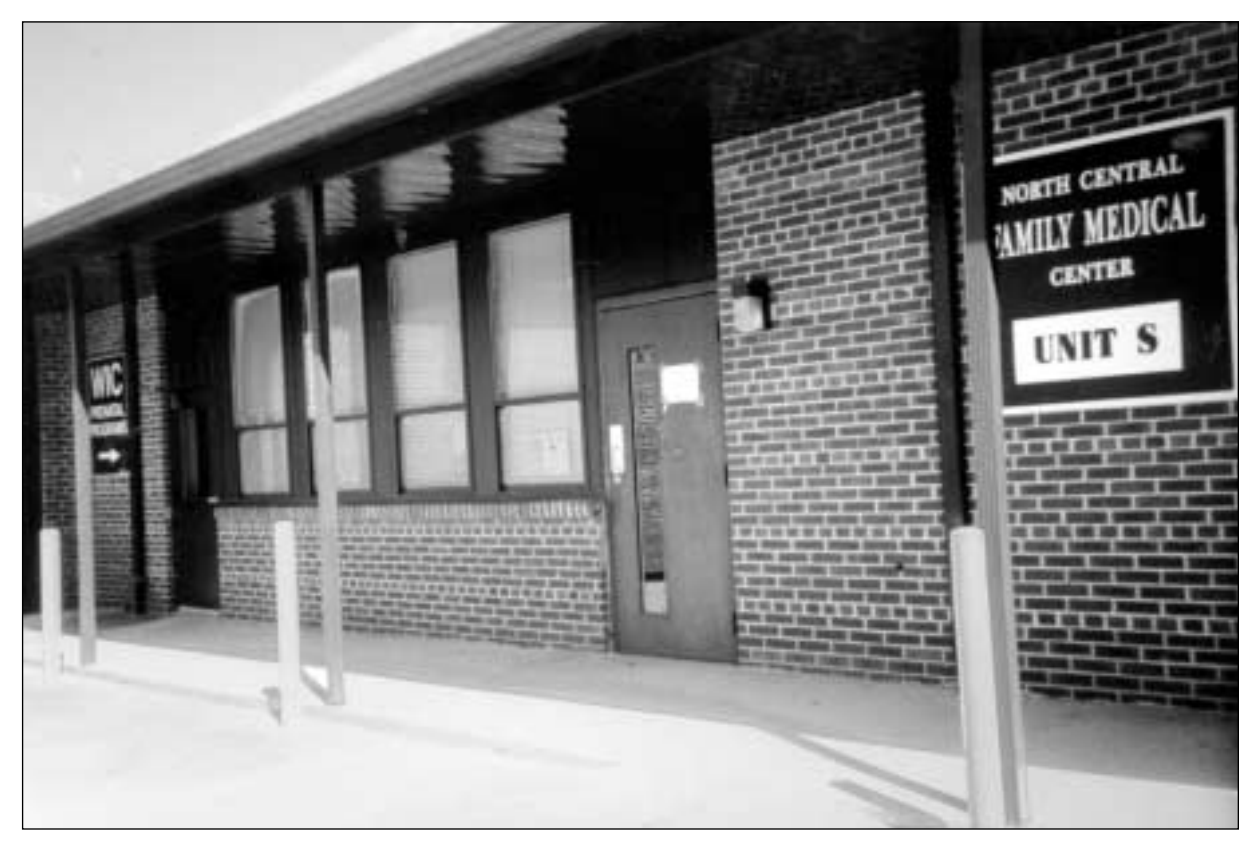
North Central Family Medical Center, Rock Hill, South Carolina

Executive Director North Central Family Medical Center 546 South Cherry Road Rock Hill, SC 29731 Tel: (803) 325-7744 x222 Fax: (803) 325-1117