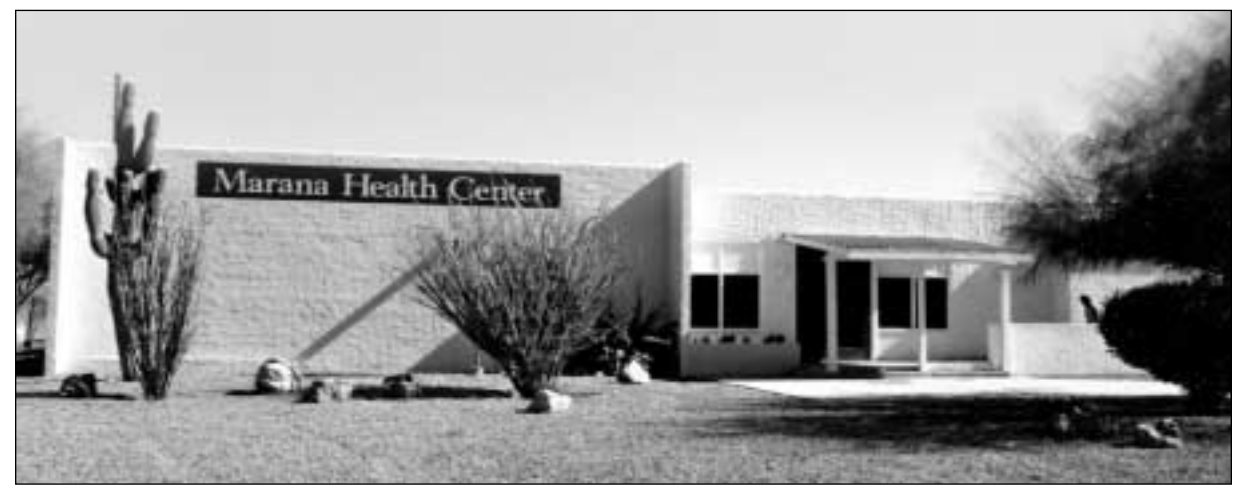
Marana Health Center, Marana, Arizona

Medical Assistant Marana Health Center 13644 N. Sandario Road Marana, AZ 85653 Tel: (520) 682-4111 Fax: (520) 682-3817