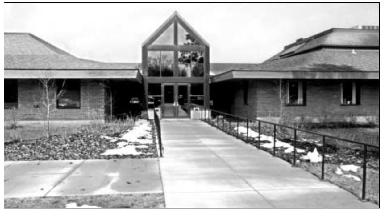
Fond du Lac Human Services, Cloquet, Minnesota

Human Services Director Fond du Lac Human Services 927 Trettel Lane Cloquet, MN 55720 Tel: (218) 879-1227 Fax: (218) 879-8378