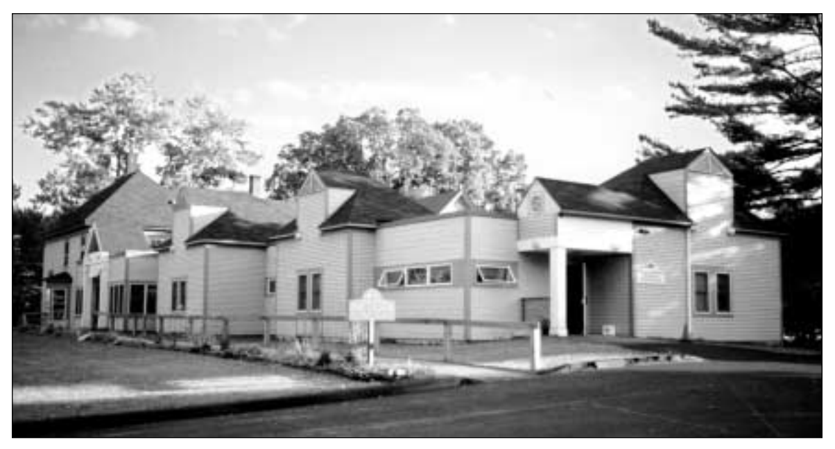
Sacopee Valley Health Center, Porter Maine

Social Services Manager Sacopee Valley Health Center 70 Main Street Porter, ME 04047 Tel: (207) 625-8126 Fax: (207) 625-7820