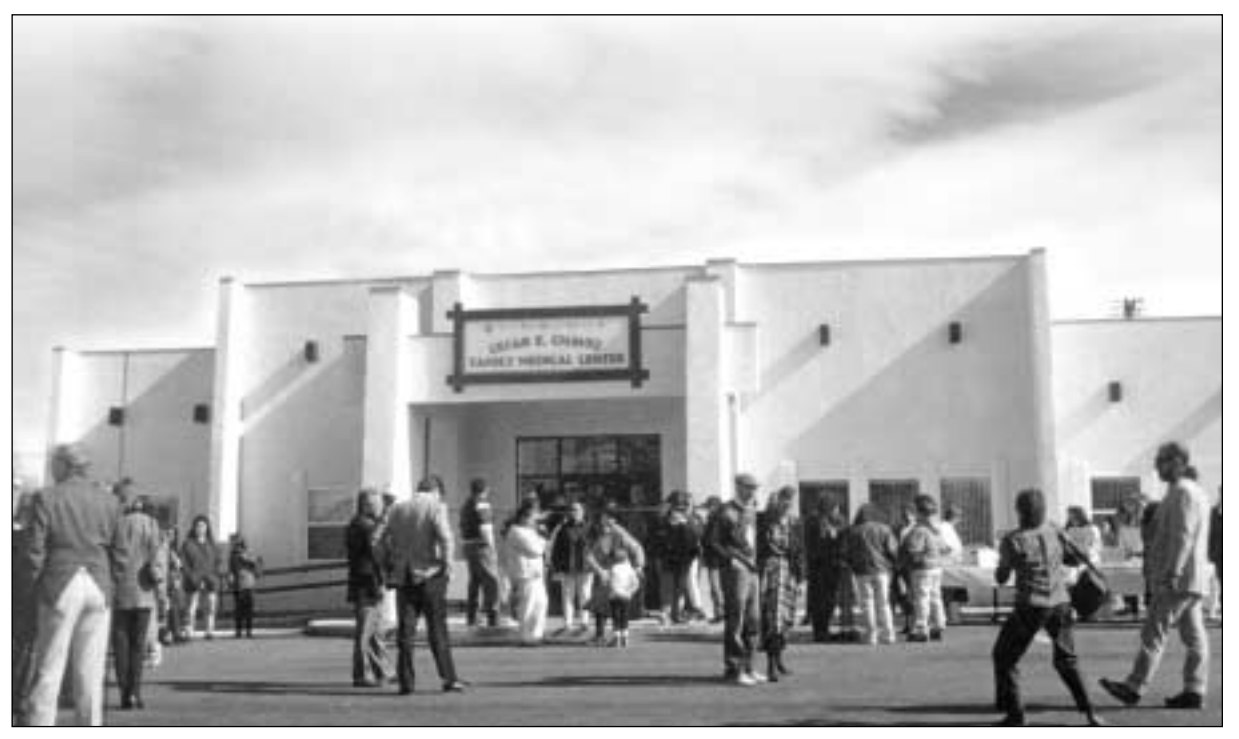
Valley-Wide Health Services, Alamosa, Colorado

Director, WIC and Nutrition ServicesVice President of OperationsValley-Wide Health Services WIC ProgramValley-Wide Health Services, Inc.204 Carson Street204 Carson StreetAlamosa, CO 81101Alamosa, CO 81101Tel: 719-589-5161Tel: 719-589-5161Fax: 719-589-5722Fax: 719-589-5722