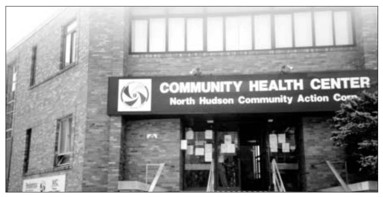
North Hudson Community Action Corporation, West New York, New Jersey

President/CEO North Hudson Community Action Corp. 5301 Broadway West New York, NY 07093-2622 Tel: (201) 866-2388 Fax: (201) 330-3803