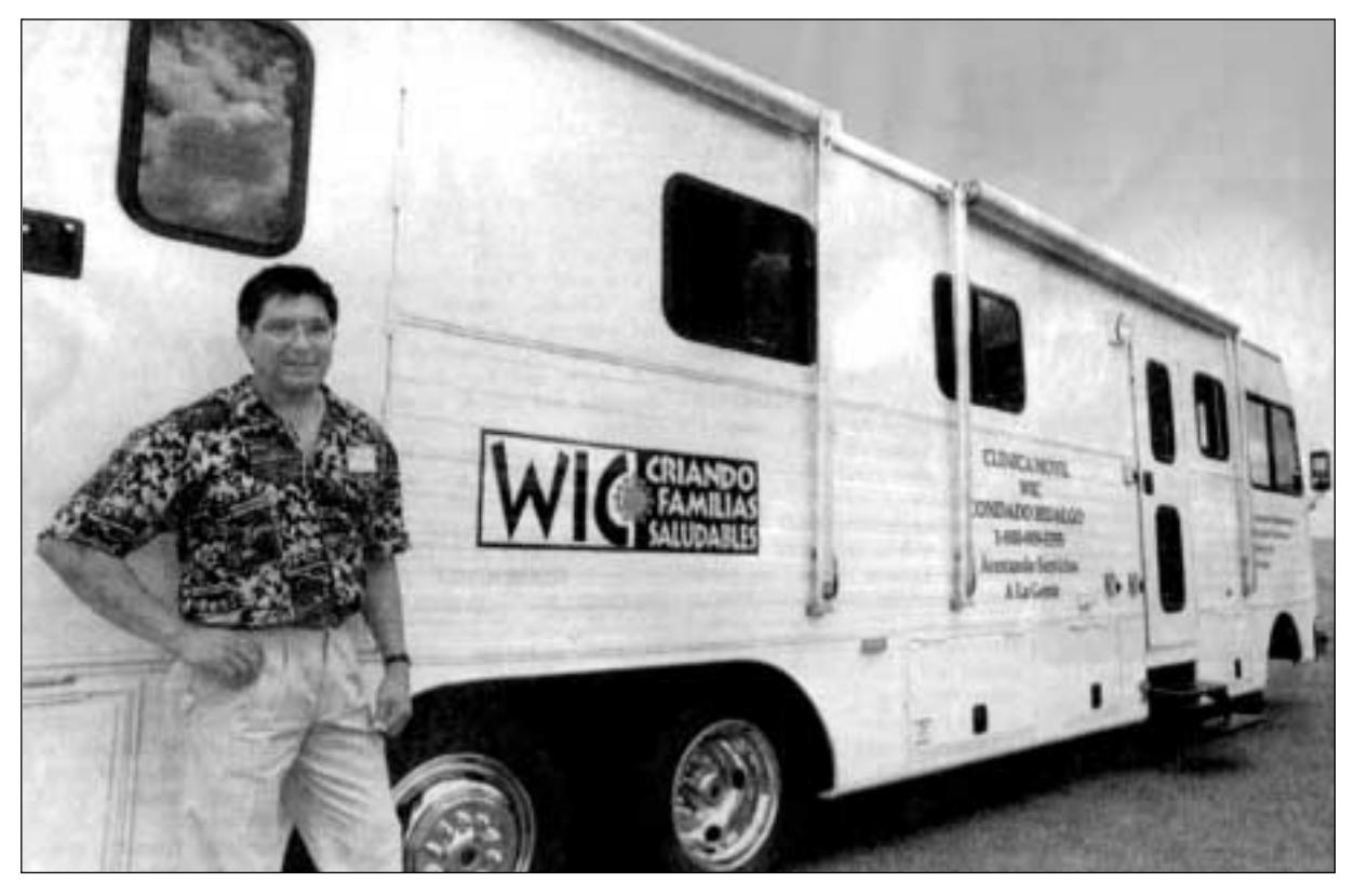
Hidalgo County WIC Program Mobile Van, Pharr, Texas

Executive Director Hidalgo County Health Care Corporation 1203 East Ferguson Pharr, TX 78577 Tel: (956) 787-8915 Fax: (956) 781-4384