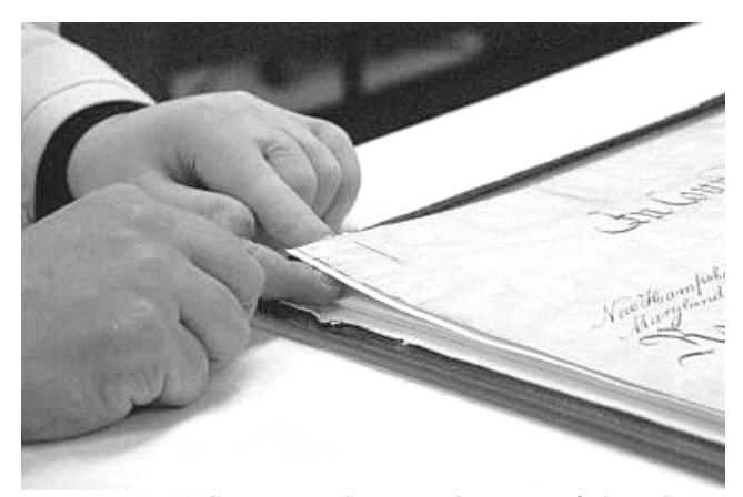
NARA Conservator Separates One Page of the U.S. Constitution from Its 1953 Handmade Paper Backing