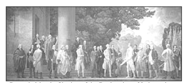
Rotunda Mural - Signing of the Declaration of Independence

With the reopening of the Rotunda, the four pages of the Constitution occupy the center cases, with the Declaration of Independence to their left and the Bill of Rights to their right. In seven cases to the left of the Declaration is a rotating group of original milestone documents that chronicle the creation of the Charters of Freedom in the 1770s and 1780s. To the right of the Bill of Rights are seven cases that show the evolving interpretation and development of the Charters of Freedom at home and abroad since they were adopted.