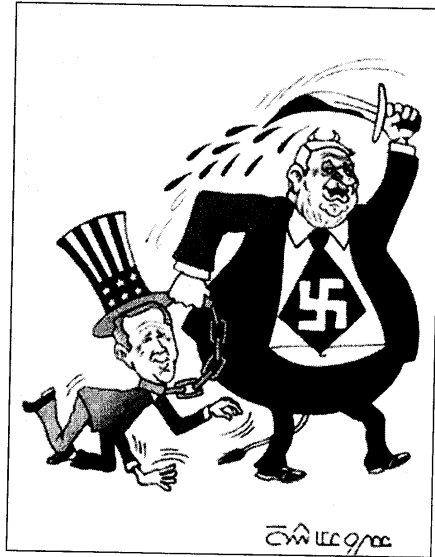
Al-Wafd (Egypt), March 27, 2004