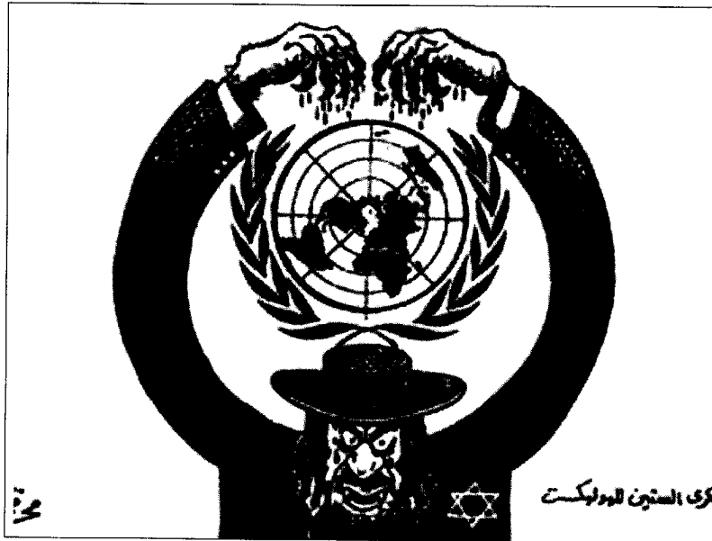
Akhar al-Khalij (Bahrain), January 2005