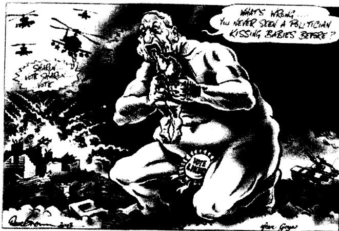
The Independent (United Kingdom), January 27, 2003

On the coffin: "Al-Hariri"; on the right, "The Beneficiaries", and on the left, "The Losers – France, Lebanon and Syria".