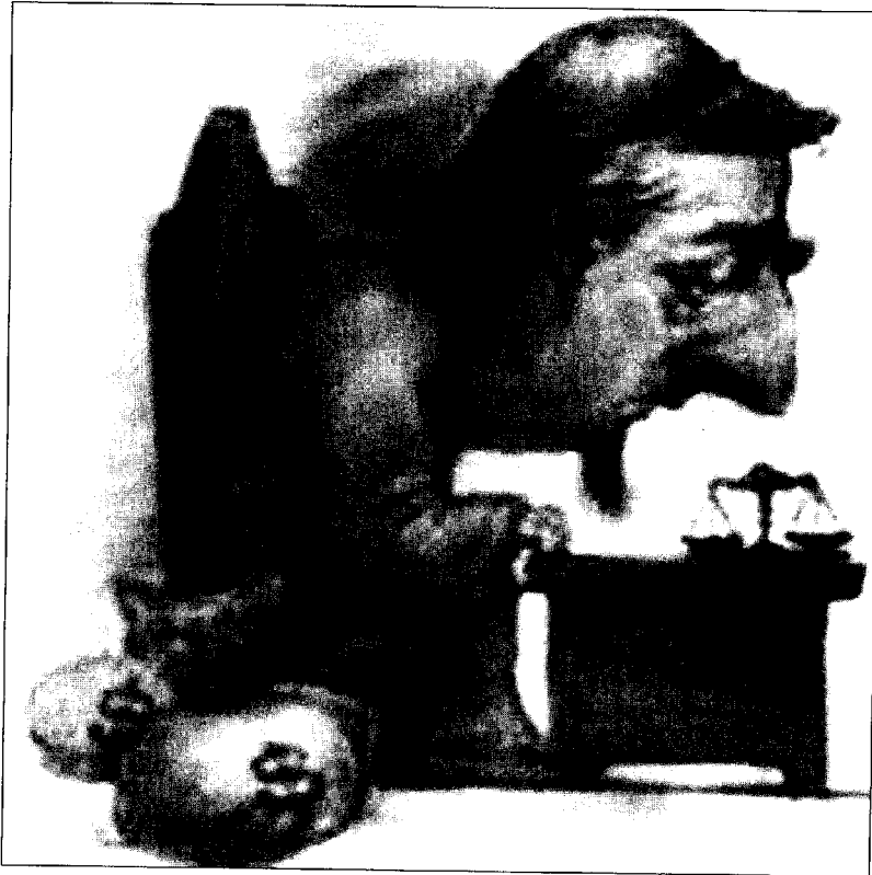
La Voz del Interior (Argentina), January 30, 2005