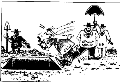
Tishrin (Syria), February 23, 2005

The UN and "Foreign Intervention" are causing "Lebanon" to fall into the grave dug by the Jew.