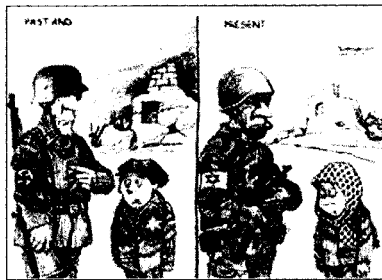
Kleine Zeitung (Austria), May 19, 2004