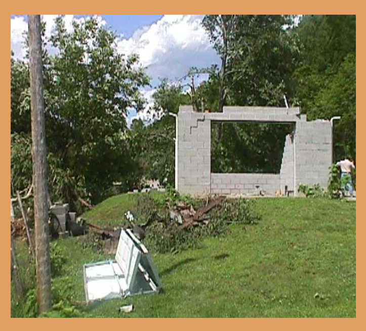
Damage to a garage from an F1 tornado that struck Knox county early in the morning of May 31st.

Thunderstorms erupted along a slow moving warm front late in the morning on May 30<sup>th</sup> and continued well into the evening. These storms brought damaging winds, large hail, including a 2.5 inch hailstone reported in Harlan county at Bledsoe, and flash flooding due to the slow movement of the storms. In Martin county, over 300 homes were damaged from flooding leaving nearly 1,000